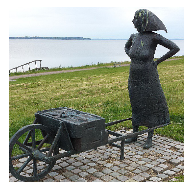
Figure 1. The photographer wants to show the attractiveness of the city by using one of the most famous sculptures in the city.

The acting tourist has adopted a realist perspective on photography. This epistemological standpoint guides their practice. According to Chalfen (2002) nonprofessional photographs are guided by evidentiary ideals. Images are made to prove or to reaffirm an event. In this case participants of the project discuss motives