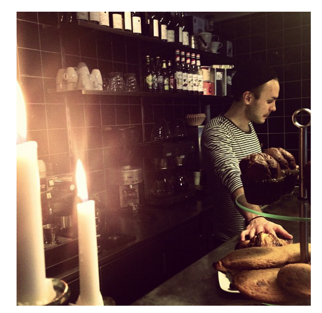
Figure 2. The photographer wants to emphasize positive everyday life in the city.

The Instagrammers argue that their main audience consists of followers of the account, i.e. users of Instagram, not necessarily geographically confined to Landskrona. The Instagrammer has the self-imposed objective to increase the number of followers for the account during their week. Based on their experience from Ins-