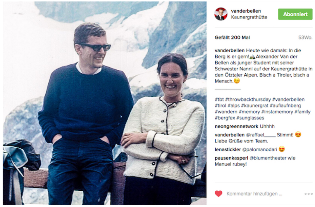
Figure 3. Throwback photo of Alexander Van der Bellen, posted on 4 February 2016.