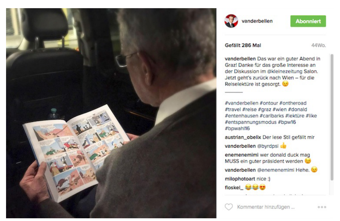
Figure 4. Reading a Donald Duck comic book, posted on 11 April 2016.

2016), watched a game on a television screen before an interview (in May 2016), or posed for photos with soccer fans in July 2016 and in October 2016.