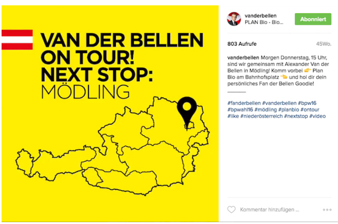
Figure 1. Van der Bellen on tour, posted on 6 April 2016.

The image type media work (n = 79) comprises visual imagery that shows the candidate during interviews or press conferences, or at events organized by media representatives (e.g., panel discussions). Among these