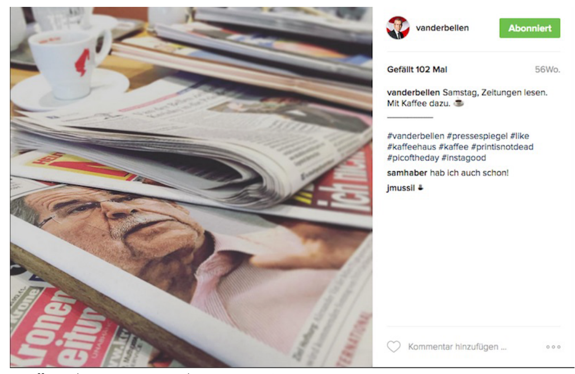
Figure 5. Coffee and Newspapers, posted on 9 January 2016.

or welcome ceremony, or shaking hands), discussion (n=18; Van der Bellen was frequently presented in debates with young voters) and endorsement (n=17; which showed mostly prominent supporters, e.g. in March, April and May 2016) underscore the political importance of the candidate.