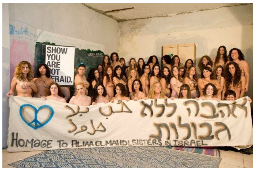
Figure 3. Israeli women posing nude "Love without Limits" and "Homage to Aliaa Elmahdy Sisters in Israel" (2011).

her and divert her message. In effect, they used the same participatory tool and approach the supporters used to endorse Elmahdy in order to mock and reject her.