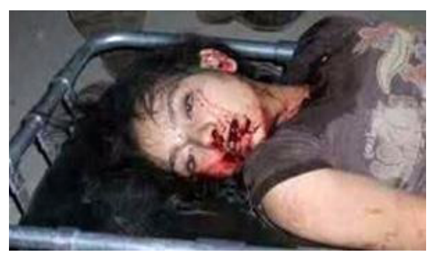
Figure 5. A falsely attributed image that appears to depict a deceased woman bearing a resemblance to Aliaa Elmahdy. False rumors about Elmahdy's death continued to spread online supported in part by this image, December, 2011.

For instance, in late November, 2011, reports surfaced around the Web that Elmahdy has been beaten in Cairo's Tahrir Square where demonstrators had been rallying against the Egyptian regime for months. The reports even referred to a YouTube video clip that showed a young female protester being pushed and beaten by an angry crowd (Taghyer, 2011) (Figure 5). Despite the fact that the video never showed a close up of the mistreated woman, and therefore made it impossible to identify her as Elmahdy, the false report scattered around the Web very quickly (Mezzofiore, 2011). Even after Elmahdy announced in an interview that she was actually in hiding and was not in Tahrir Square during that incident, the rumor kept circulating, generating especially furious reactions (CyberDissidents, 2011).