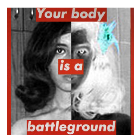
Figure 2. Composition submitted to Elmahdy's blog "A Rebel's Diary" by online supporters who remixed a closeup of Elmahdy's face upon the historical photo-based work of the established artist Barbara Kruger (2011).

Kruger's work depicts a black and white imagery of a woman's face vertically split in two halves, combined with bold, red blocks of text running across the composition. Dividing the image into two parts, she keeps the right half in positive while she inverts the other half into a negative image. The play with positive and negative spaces is to bring attention to the binary oppositions