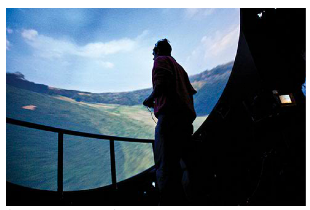
Figure 2. Still from Psychasthenia 1 .

boding scenes, including claustrophobic tunnels, amorphous figures lurking in cells, and a twisting corridor peopled by grimacing patients subjected to galvanic facial contortions. After making it through the game world, which adapted to the head movements of the user by affecting lighting, tunnel size, and so forth, the user was inevitably "diagnosed" as suffering from "psychasthenia". The in-joke was that there was no way out; the end-diagnosis was an inevitable condition of participation. The question was merely how one arrived there, and how much worse the condition became over the duration of the experience of "diagnosis".