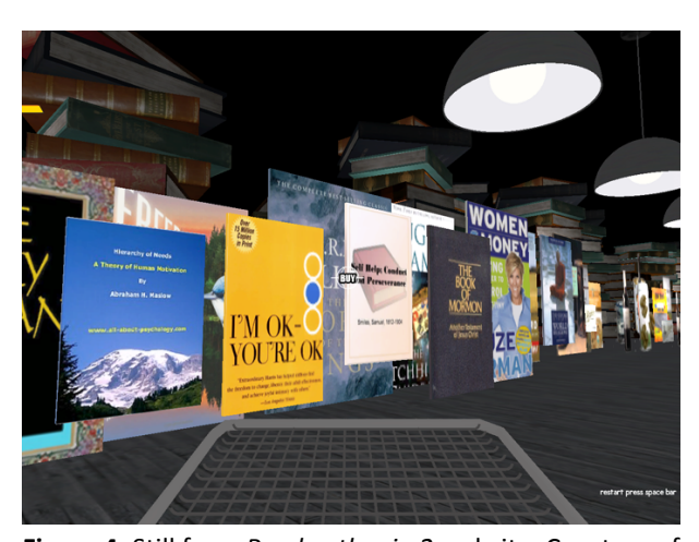
Figure 4. Still from Psychasthenia 2 website.

Soon the patient is led towards a computer terminal where the first round of testing will begin. At this point the journey begins with questions related to Maslow's "physiological" stage popping up to help refine the player's diagnosis and experience of the therapeutic "level" to follow. Now gameplay begins in earnest, as each game level corresponds to both a classic style of video game play and to a stage in Maslow's hierarchy. Dr. Carl introduces each level, following up with some questions tailored to the symptomology to be addressed. The physiology stage couples a shopping experience with exploration of an open-ended set of options. Basic biological needs met, the patient then progresses towards the "safety" stage where the patient must encounter his or her primal fears through the experience of killing various monsters that crop up on the way to treatment. The third stage, love/belonging, becomes a social challenge, with the patient determining which kinds of social relationships will best assuage their symptoms through interactions in a coffee shop. Social needs met, the patient next challenge is building up the esteem of peers, expressed here through workplace challenges set in an unusual office environment. Finally, self-actualization achieved, Dr. Carl sends the patient on his or her way, with admonitions to follow the treatment plan and an ominous warning that the door is always open for return.