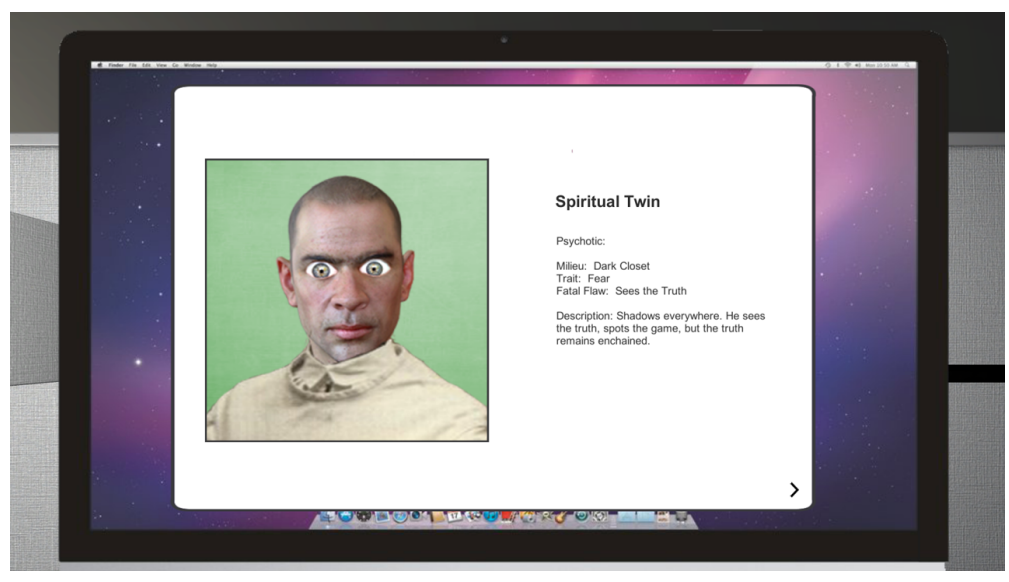
Figure 8. Still from Psychasthenia 3: Dupes.

The system reveals the characters representing the user's Spiritual Twin and Nemesis, as shown in Figure 8, as well as numerical Success Index broken down with pie charts, as shown in Figure 9, and a final Fate card. The