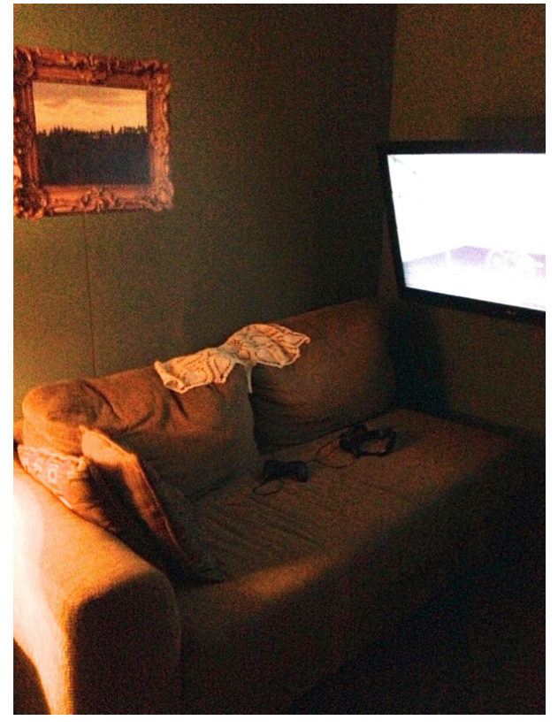
Figure 6. Installation photo from Psychasthenia 2 website .