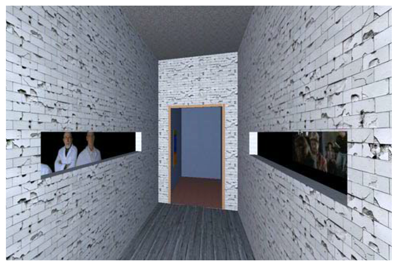
Figure 1. Still from Psychasthenia 1.

Users answered psychological test questions based on the Minnesota Multiphasic Personality Inventory, though modified to suit the game's tone and slant. These were interspersed within increasingly abstract and fore-