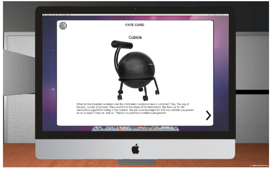
Figure 13. Still from Psychasthenia 3: Dupes .