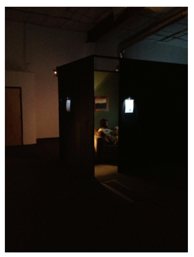
Figure 5. Installation photo from Psychasthenia 2 website. Courtesy of the authors.

Psychasthenia 2 was shown in other juried new media venues as well. This acceptance of the work as new media art was a breakthrough for us, in that the first piece, Psychasthenia 1 was understood and appreciated more as a technological experiment than as an artwork in itself. It required a specialized setup and