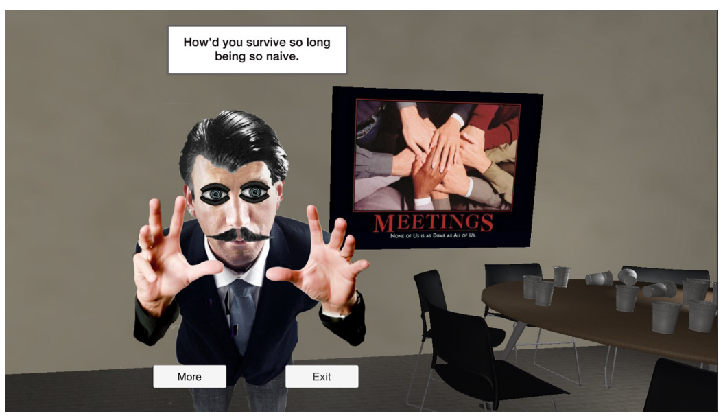
Figure 7. Still from Psychasthenia 3: Dupes .

Like Psychasthenia 1 and 2 , in which we used an altered version of the Minnesota Multiphasic Personality Inventory to "diagnose" and "treat" the user's condition, Psychasthenia 3: Dupes is structured around a psycholog-