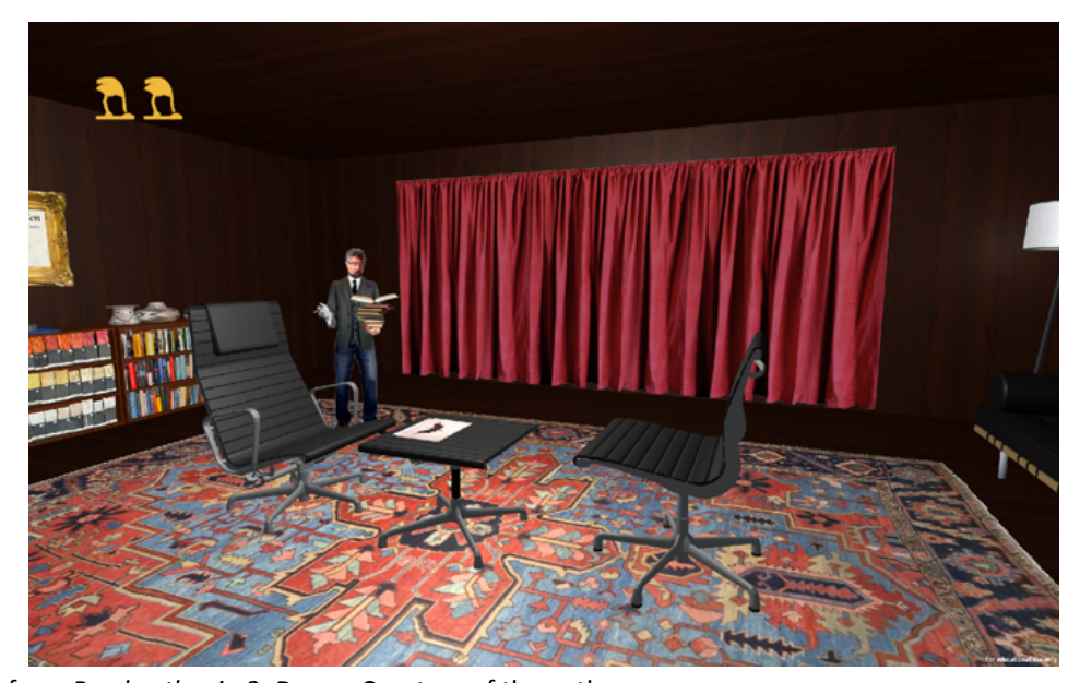
Figure 10. Still from Psychasthenia 3: Dupes .

In Psychasthenia 3: Dupes we reflect the preoccupations of gamified internet culture in several ways relevant to its 2017 debut. The pompous doctor's innovative "new method" resembles nothing so much as a Buzzfeed quiz (see Figures 10 and 11). Several of the subsequent char-