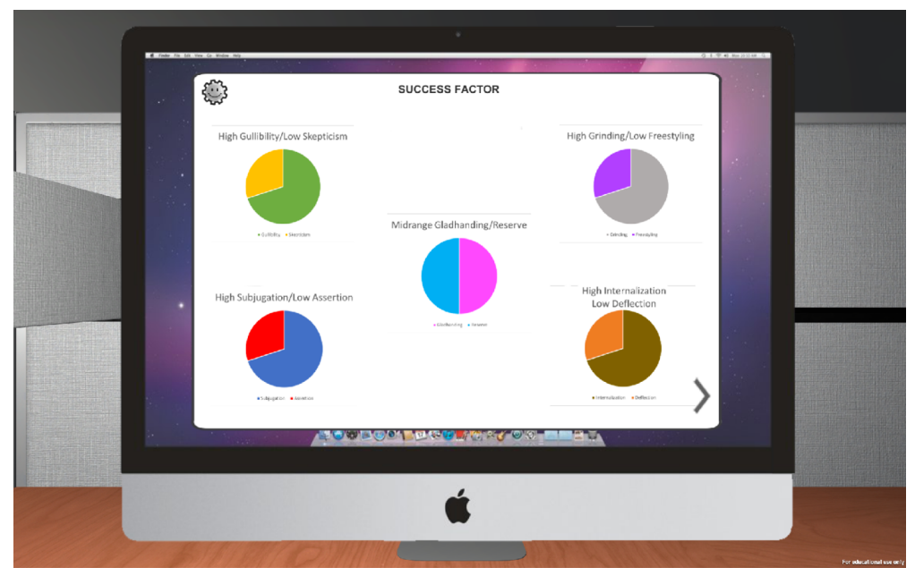
Figure 9. Still from Psychasthenia 3: Dupes.