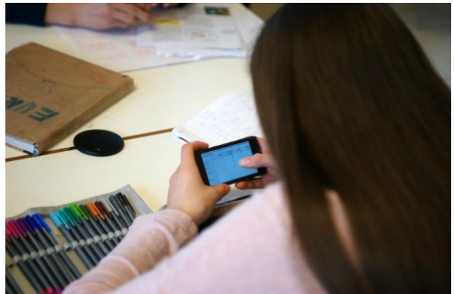
Figure 2. Pictures of the students working with the Punnett square diagram.