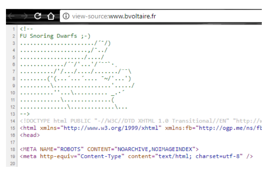
Figure 4. BV became aware Sleeping Giants France was inspecting their source code and inserted this HTML comment into their pages for the activists to find.

First, many of the activists in their day jobs had some relationship to marketing, advertising, or media—