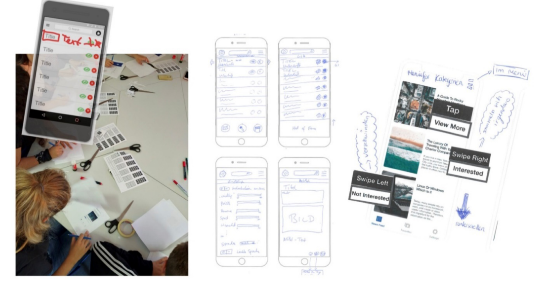
Figure 1. Example of a co-creation workshop.

'developers' and 'users' but it does make it possible to ease the rigid boundary between them. That said, across the workshops the focus on the prototype as a relational boundary object turned out to be central: Its iterative development has connected the sequence of the different workshops in a meaningful way and it also offered the participants in their practical work an orientation within each respective workshop particularly in regard to its position in the development process as a whole. The practical work with paper, pen, and scissors was used to playfully visualize ideas. This provided opportunities to stimulate the "practical consciousness" (Giddens, 1984, pp. 41-45) of the workshop participants: On the practical level of their 'everyday doing' they 'know' how they would (like to) act with such a news platform, while 'discursively,' for example, in an interview or by means