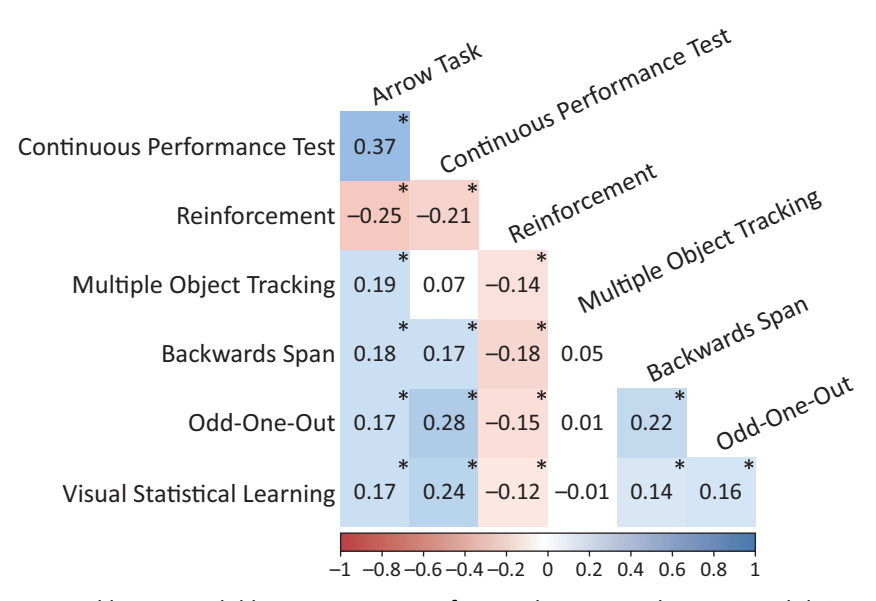
Figure 1. Values from general linear model between League of Legends MMR and cognitive abilities.