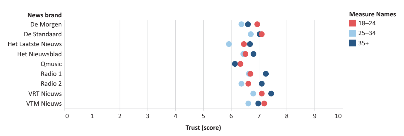
Figure 1. Trust in news brands by age. Notes: The question was 'How trustworthy would you say news from the following brands is? Please use the scale below, where 0 is "not at all trustworthy" and 10 is "completely trustworthy." See Table 1 in Supplementary File Annex 2 for exact numbers and statistical significance tests.

We see more remarkable differences when considering education levels (see Figure 2). Higher-educated citizens trust VRT's news radio Radio 1 significantly more than lower-educated citizens, who in turn trust commercial brands like Het Laatste Nieuws and VTM Nieuws more