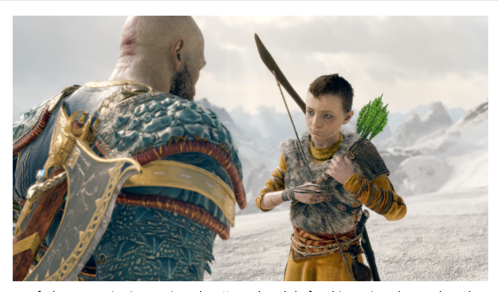
Figure 1. Close-up of a heartwarming interaction when Kratos kneels before his son in a close and gentle manner to fix his broken quiver (taken from in-game screenshot). Source: SIE Santa Monica Studios (2018).