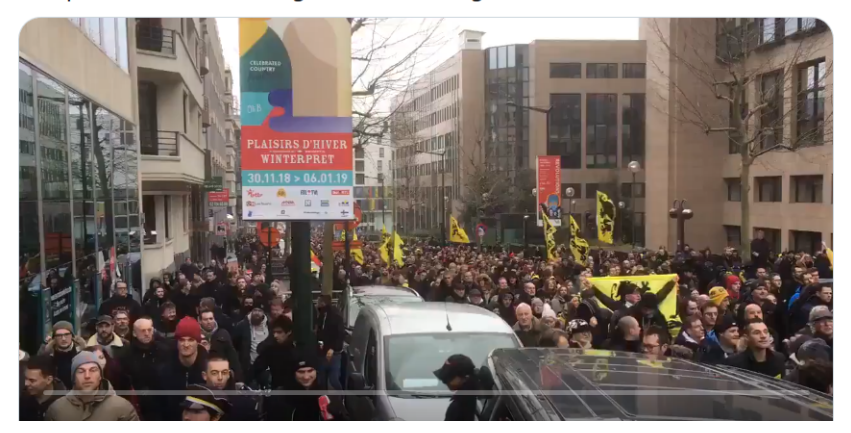
Figure 3. Tweet with a video of demonstrators against the GCM.

Europeans have had enough of mass-immigration!