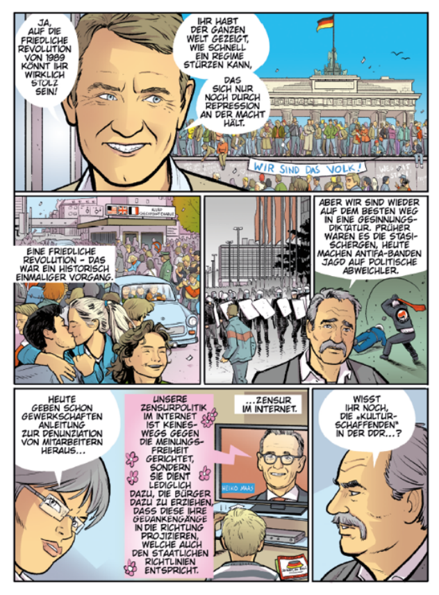
Figure 2. Screenshot of AfD comic "Fed up with bloc parties."

#VollendeDieWende (#AccomplishTheTurnaround) was used for most Facebook posts and an encouraging tone