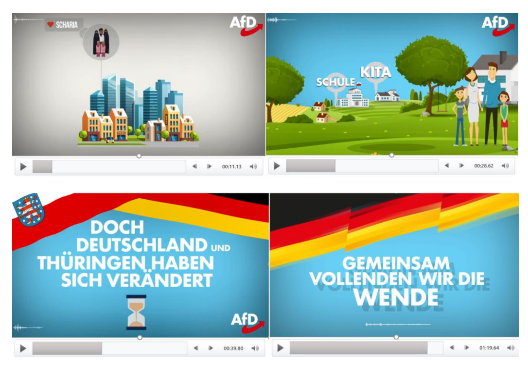
Figure 3. Four screenshots taken by the authors from AfD video "Radio commercial of AfD for the Thuringia federal state election on 27.10."

Mass migration from the Far East and Africa, Islamic extremism, the decay of domestic security, rise in crime, rule by Arab clans, general brutalization and neglect; the Euro crisis, expropriation of savers by a zero-interest policy of the ECB, the destruction