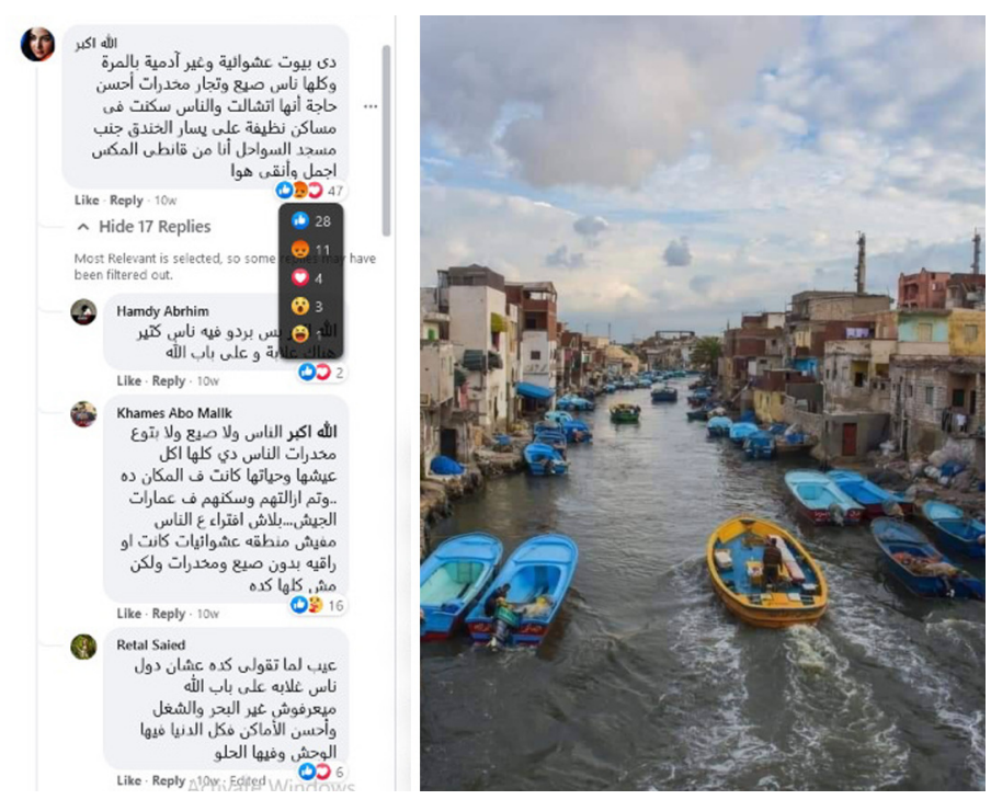
Figure 5. A screenshot for a picture of Al-Max and the comments section on a Facebook post that showed the fishing village before the relocation.

The residents' perception of media and their new home is still influenced by the recent relocation, and the interviews revealed their grief and a longing for the life they had before. Many of the relocated residents interviewed in October 2020 brought up scenes from the Bolteya El-Ayma movie repeatedly to explain how