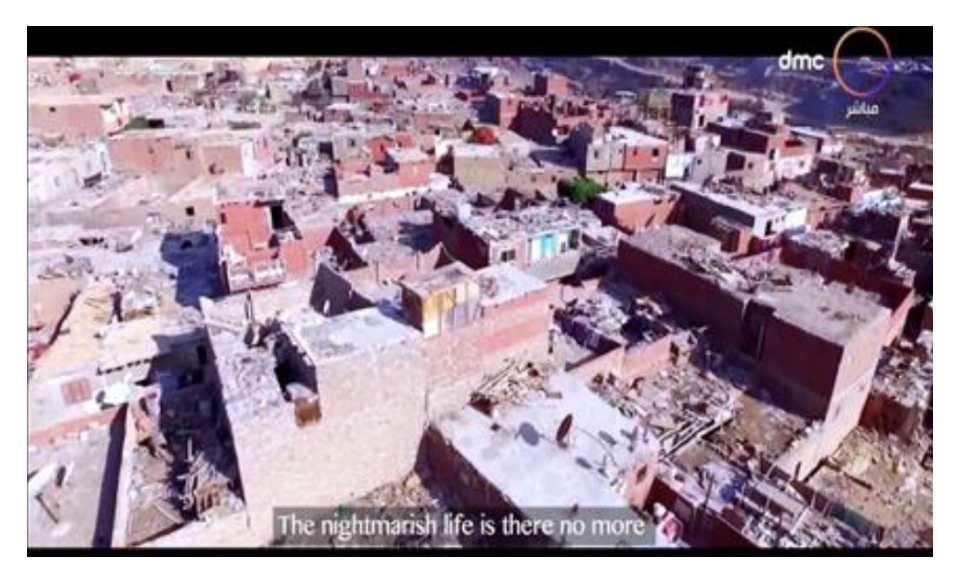
Figure 2. Still image from Man Ahyaha.

An exploratory review of the Facebook pages reveals contradictory opinions about life in Al-Asmarat. Comments reflect the same pattern as that detected in official media. One party praises the advantages of the new life granted to the ex-slum dwellers, advocating the efforts to improve the living conditions of thousands of people. The other party uses social media as a channel to vent anger, discussing their bitter dissension and disclosing their indignation towards the project, as can be seen in Figure 4.