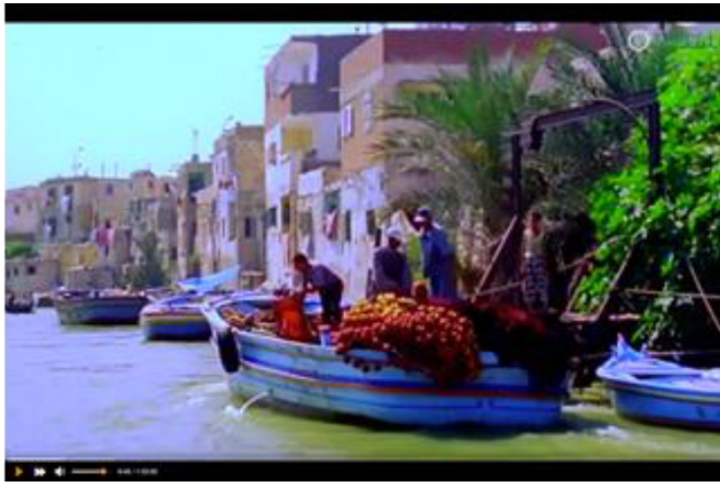
Figure 6. Still shots from Bolteya El-Ayma . Notes: On the left, the main character is standing on the ruins of her demolished house; on the right, it's a depiction of daily life using the canals.