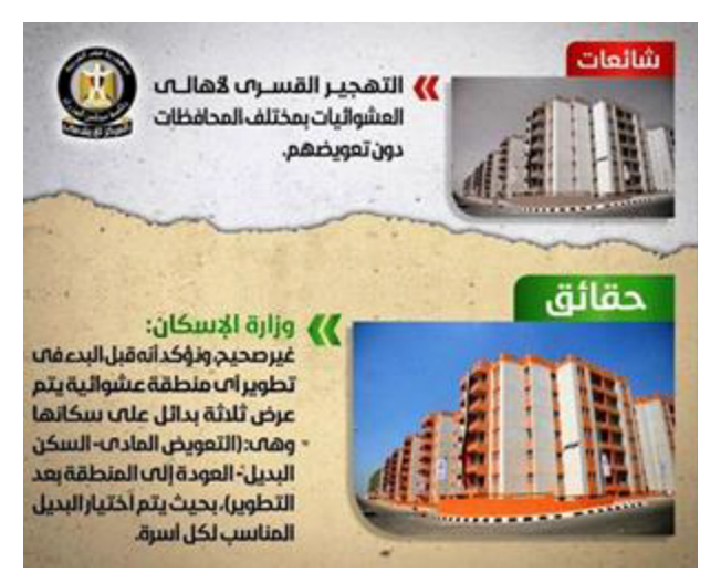
Figure 3. Official announcements to respond to rumors regarding Al-Asmarat through online channels. Note: translation—"The rumor: Forced eviction for ashwa'eyat residents without compensation. Facts: Ministry of Housing: Not true, as we confirm that before developing any ashwa'eyat area, three alternatives are offered—financial compensation, alternative housing, returning to the area after development—and the appropriate alternative is chosen for each family."