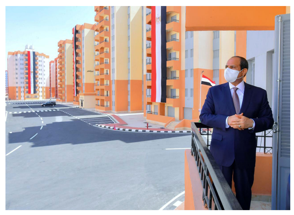
Figure 1. Media coverage for the inauguration of Al-Asmarat.

Values such as decency and cleanliness found in the new environment are promoted through sentences such as, "The new generations will grow up in decent places and not see what we have seen or what our parents have