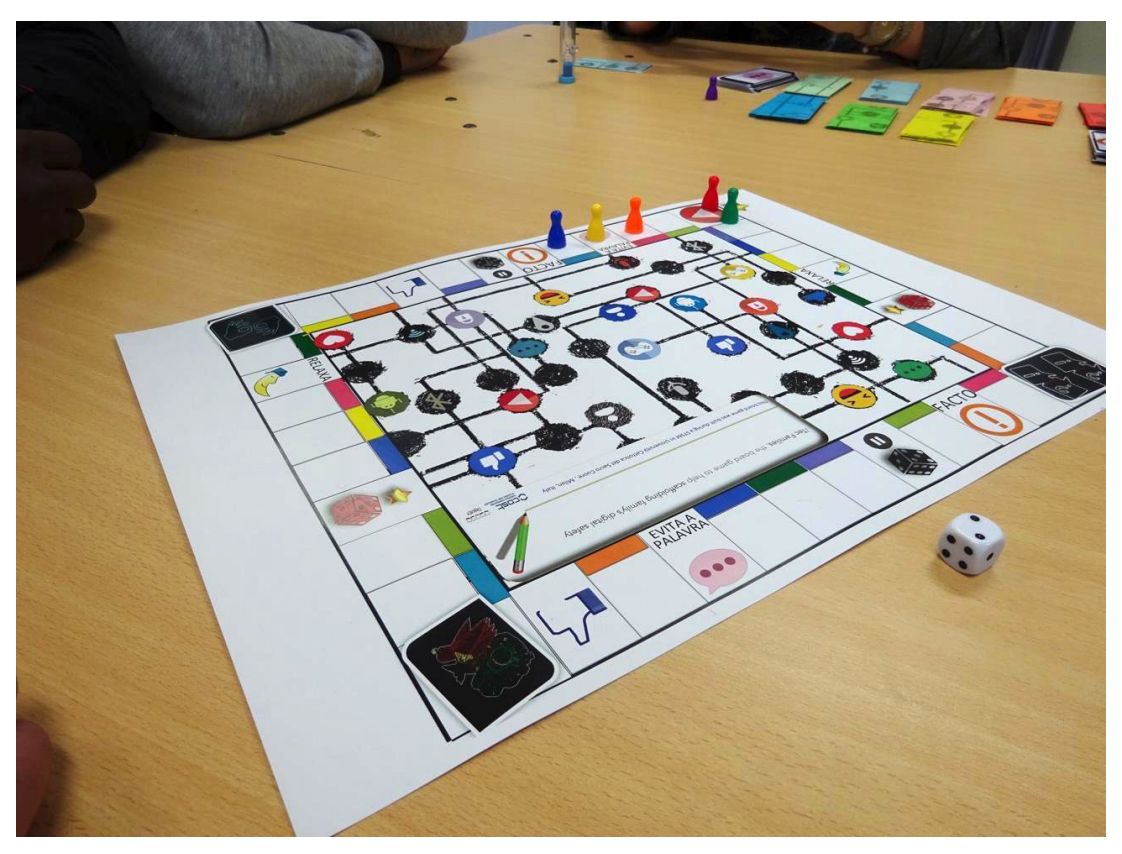
Figure 1. Boardgame.

The digital photography sessions captured their attention easily and motivated them to action. Very few participants had ever used a camera like the ones employed in the project. They were more familiar with taking pictures just using their mobile phone. Very few understood composition rules or believed that photography could allow them to express feelings and perspectives (EC1, EC2, and EC3 field notes and initial questionnaires). They were challenged to document their everyday lives in the EC with pictures. The three pictures depicted here illustrate that. Some of these pictures (e.g., Figures 2 and 3) allowed them to look at details