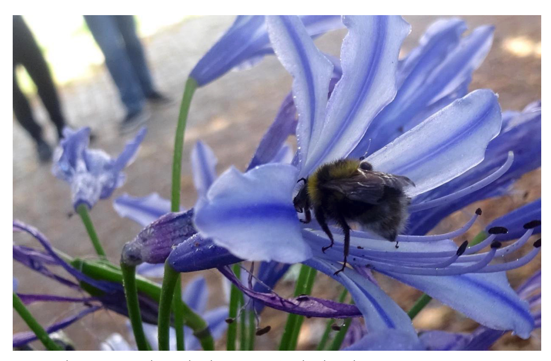
Figure 2. Nature at the EC.

that used to go unnoticed. The photographs revealed a high standard of technical and compositional quality. In cases where that did not happen (for instance, with youth with cognitive impairments), we still could find a strong message in the pictures. The use of the cam-