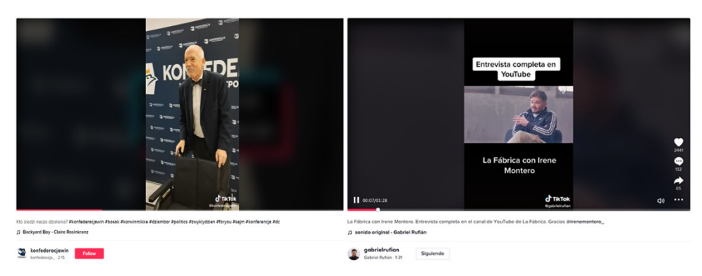
Figure 3. Examples of persuasion based on pathos on TikTok. Note: On the left, different politicians from Konfederacja party are shown in attractive scenes of their everyday lives, displaying positive emotions; on the right, Gabriel Rufián, shows his TV interview with Irene Montero where he calls politicians from the far-right VOX party as being "nazis," displaying negative emotions.

an example of the use of historical data in a video by a Spanish political leader.