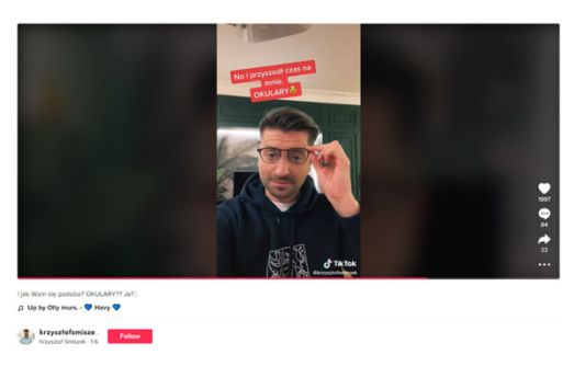
Figure 2. Example of non-political content on TikTok. Note: In this video, the Lewica politician Krzysztof Śmiszek is seen trying on new glasses with the caption, "Well, my time has come. Glasses."

content was scarce. Figure 2 represents one of the rare examples of a political leader using his TikTok account for showing personal or private aspects of his life, away from his political role.