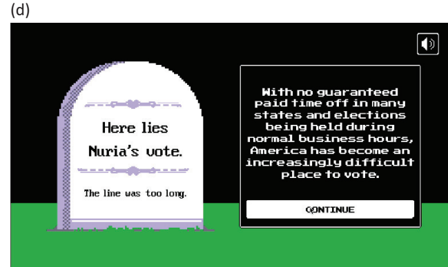
Figure 4. Screenshots from The Voter Suppression Trail.