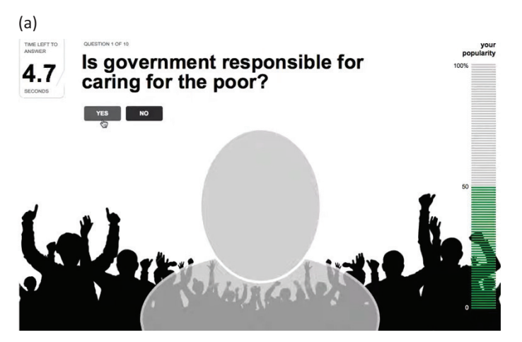
Figure 1. Screenshots from The Waffler.

The most prominent feature of games in this category is that they perform Political Commentary from a cynical perspective through visual and written rhetoric in combination with simple game mechanics. The six games