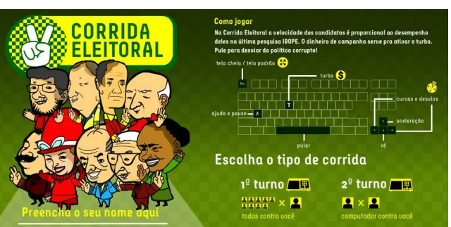
Figure 5. Screenshots from Corrida Eleitoral.