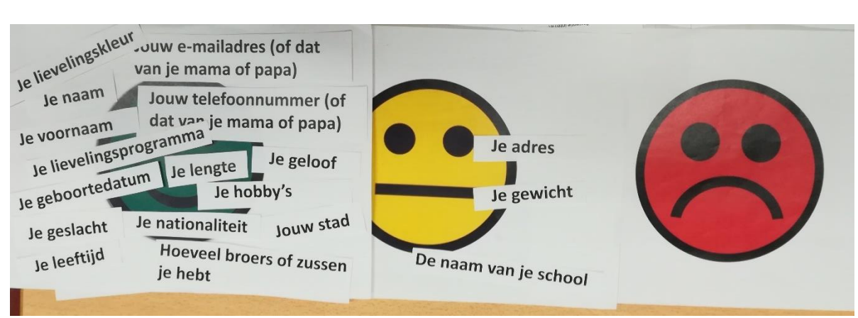
Figure 4: An example of a child's willingness to disclose different types of information.