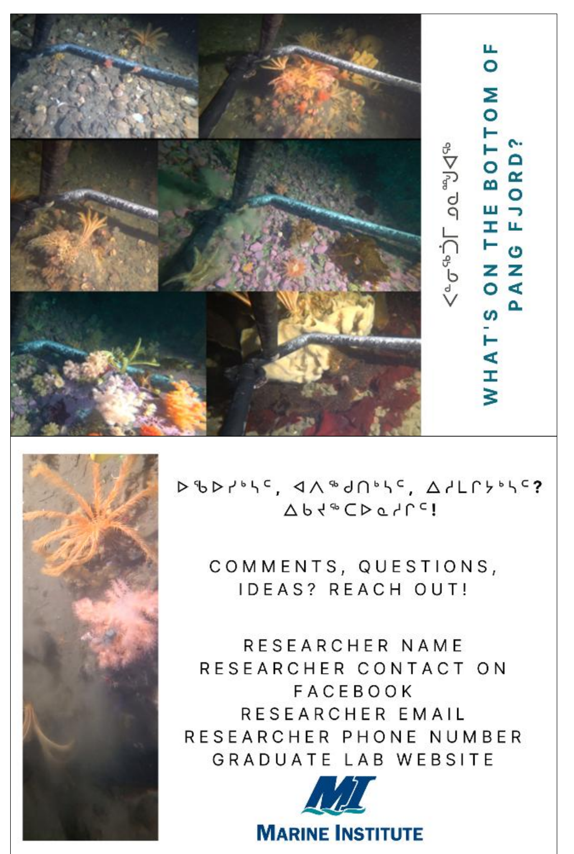
Figure 3: Contact cards left in every public building in an Arctic community. Back of the post card has been altered to preserve personal information.