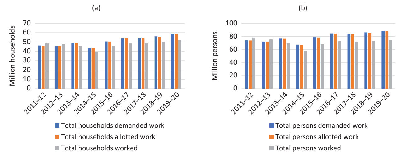
Figure 2. Total household demand for work, allotted work, and actually worked (a), juxtaposed against total persons demanded work, allotted work, and actually worked (b). Note: Figures in million Rupees (constructed from data in public domain).

Therefore, what emerges from the data is that at least in terms of demand for, allocation of, and actually undertaken public works at both the household and individual levels, there has been a largely upward trend since the NDA took office in 2014. This upward trend has also been mirrored in rising budgetary allocations. Even though this trend is not identical for total person-