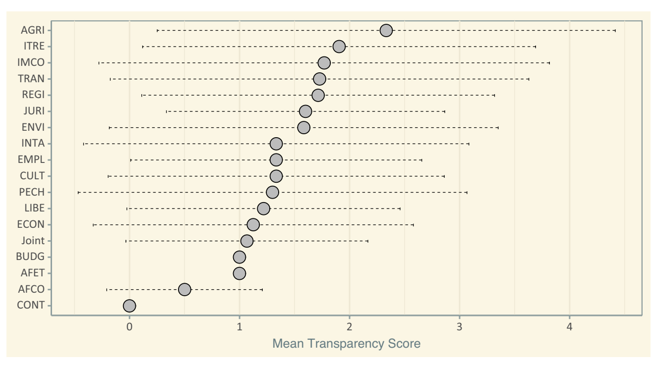
Figure 3. Mean process transparency score per EP committee.