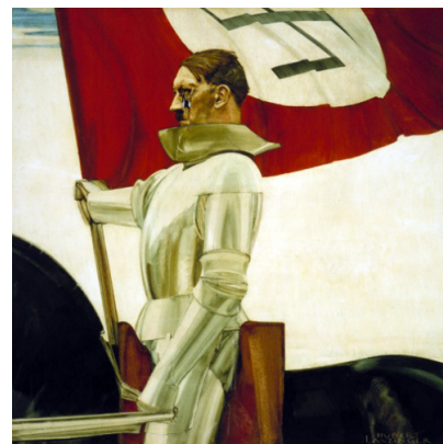
Figure 1. Der Bannerträger (The standard bearer), ca. 1935.

A more recent example from the European far-right is the intense mythologizing undertaken by the German Nazi party in the 1920s to 1940s. Nazi identity entrepreneurs liberally appropriated the mythologizing of the medieval period, as seen in the poster of Nazi leader Adolf Hitler appearing as a knight (Figure 1).