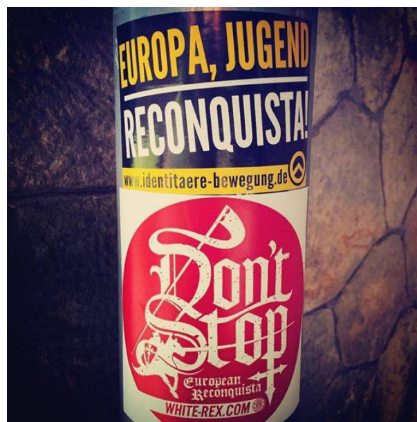
Figure 4. A sticker of the German Identitarian Movement reading “Europe, Youth, Reconquista,” alongside a sticker advertising the neo-Nazi martial arts group White Rex.

The term “crusades” is used to refer to a series of expeditions to the East beginning in 1095 aimed at regaining the Holy Land from Muslim control. For traditional historians, the crusades ended after the 1291 fall of Acre—the final major Christian stronghold. However, some historians include the Reconquista period in Spain in the late medieval period. Reactionary far-right social movements draw on this period in their ethnonational symbolism (Figure 4).