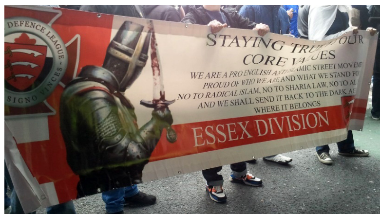
Figure 6. English Defence League Essex Division banner.