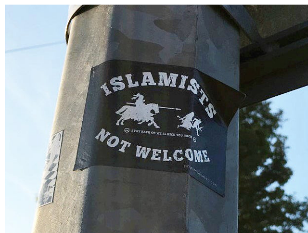
Figure 3. Generation Identity stickers appeared in an Essex town.

The term “crusades” is used to refer to a series of expeditions to the East beginning in 1095 aimed at regaining the Holy Land from Muslim control. For traditional historians, the crusades ended after the 1291 fall of Acre—the final major Christian stronghold. However, some historians include the Reconquista period in Spain in the late medieval period. Reactionary far-right social movements draw on this period in their ethnonational symbolism (Figure 4).