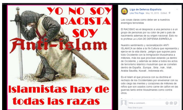
Figure 2. “I am not racist, I am anti-Islam.”

The Identitarians and Defence Leagues appropriate narratives and motifs from the medieval period to create unifying ethnonational symbols which establish a radically nostalgic interpretation of Europe’s past and idealize a mythologized “golden age” to which their adherents seek a “return.” There are many instances of the usage of ethnonational symbols in both movements and while they draw on a wide range of geographical and temporal contexts, the below homes in on the usage of symbols originating from the crusader period. This period is selected because of the ubiquity of these themes in reactionary social movement public content and the demonstrable “us vs. them” dichotomy between European and Islamic powers. Some examples of these themes are a crusader knight in prayer (Figure 2) and a mythologized crusading knight chasing away an observably Muslim mother (Figure 3).