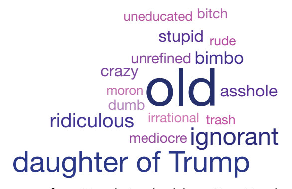
Figure 3. Words used by commenters to refer to Lizzy during the debate. Note: Translated from Spanish by the author.

In turn, viewers attempt to make sense of her immigrant background and her position against some forms of immigration with comments such as "got her papers and thinks she is a gringa" and other variations that reflect the perception that some immigrants in the United States discriminate against others once they become