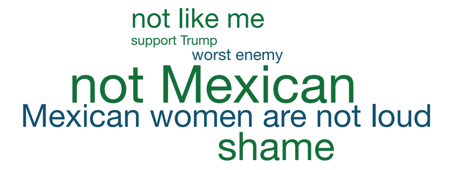
Figure 4. Words used by commenters to refer to Lizzy throughout the debate. Note: Translated from Spanish by the author.