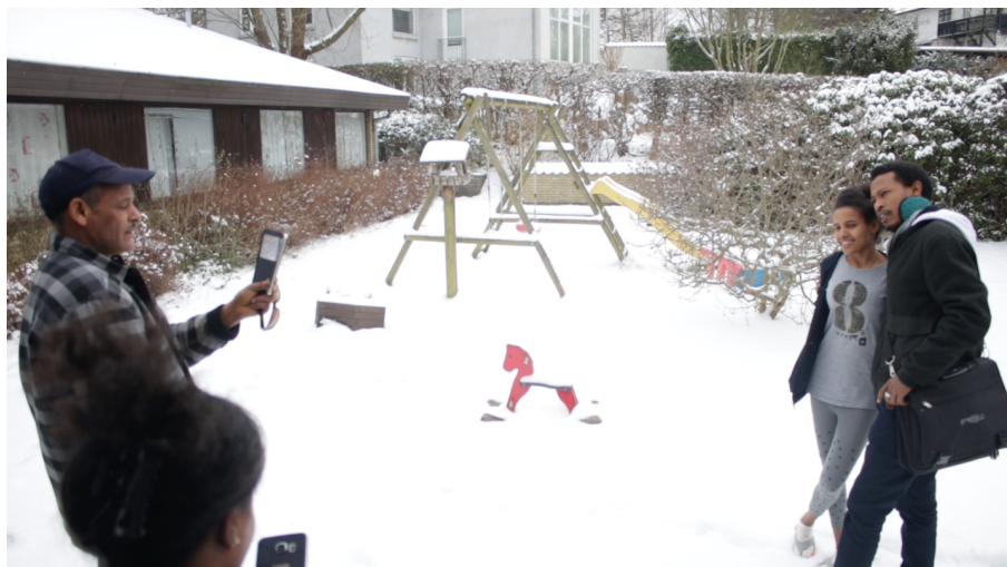
Figure 12. It was the first Danish winter for many of the residents of Hannebjerg. In early February, the first snow came, and the residents went outside to take pictures in the white scenery to share with their friends and families in Eritrea. February 2017.

form into acts that reimagine place and function. Beginnings and synergies are acted out as way of relating to society by assembling diverse temporal and spatial expressions.