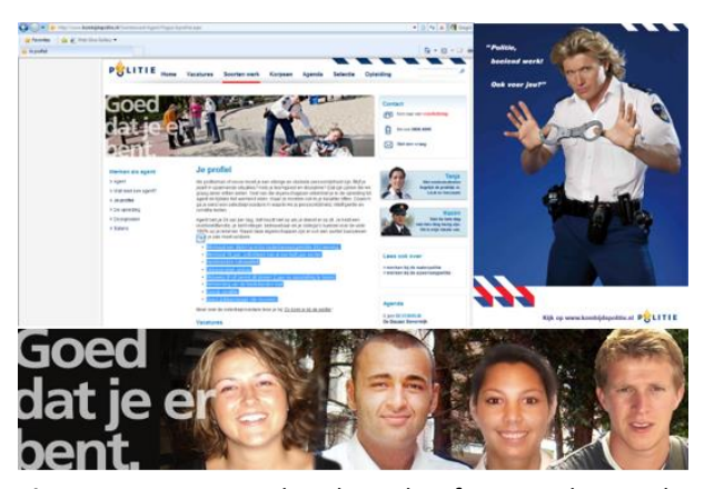
Figure 2. Diversity within the police force on the Dutch national recruitment website.

In terms of recruitment, for instance, specific attention has been paid to gender diversity in the the Politie Utrecht's recruitment communications since the 1980's and 40% of vacancies are reserved for suitable female candidates until the last possible moment, after which these openings are filled with other suitable candidates<sup>2</sup>. Also, there has been specific attention paid to diversity in terms of migrant background. Since the 1990's 30% of vacancies have been reserved for suitable candidates with a migrant background until the last possible moment<sup>3</sup>, and several programmes from the Politie Utrecht (IOOV, 2009) and a programme of the Police Academy (Politie Utrecht, 2008a) have been designed to reach possible candidates with a migrant background. Finally, the national recruitment website displays photos of female police officers and police officers with a migrant background more often than expected based on the proportion of police officers they represent within the police. The only other mode of differentiation that occasionally comes to the fore in recruitment communication is sexual orientation: the Politie Utrecht participates in Gay Pride Parades, and the 2009 national recruitment campaign included a famous openly gay Dutch magician, Hans Klok. These conclusions are illustrated in Figure 2.