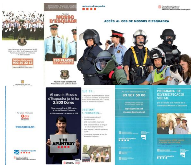
Figure 3. Diversity in publicity for the Mossos d'Esquadra.