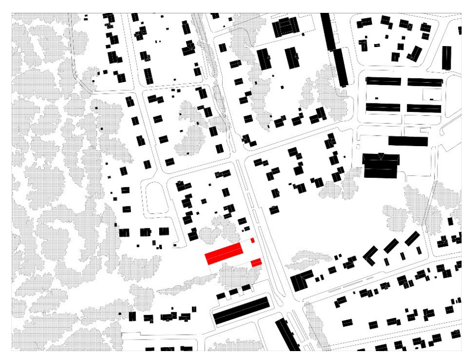
Figure 1. Fringe localization I. This figure shows the site plan over the planned accommodation of case 2. The localization is in between two existing neighborhoods surrounded by a road, a park and two residential houses. Drawing by Andrea Gimeno Sanchez.

Case 2 shows clearly how dimensions of localization as externality were played out. The process of building the new supported accommodation was abruptly aborted owing to objections from neighboring property owners, forcing the municipality to continue providing supported accommodation in the inadequate and inappropriate facilities. According to the informants, the reason for objecting was that the new accommodation presented a perceived threat to the residents in the neighborhood. One informant described the complaints as "these people can be dangerous; we cannot let our children out. So, there is a lot of lack of knowledge and prejudice. I would say that it is mostly about lack of knowledge" (case 2, manager, social services).