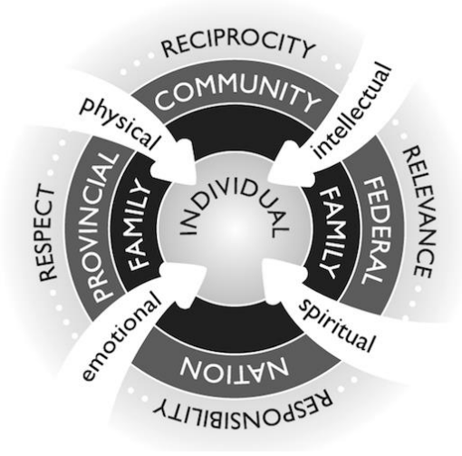
Figure 1. Indigenous Wholistic Framework.

Building on Figure 1, Figure 2 provides a visual representation of the interconnections in an institution between senior administration, faculty/departments, and faculty/staff/student with policies, programs, and practices. It shows the inter-relationships of the global-national-local to higher education, particularly evident in Canada's structure of provincial jurisdiction of education but federal responsibility of First Nations, Métis, and Inuit education. Indigenization as a form of social inclusion requires recognizing the work and dedication that has happened from the grass roots of an institution to the senior executive leadership to create systemic and broader societal change.