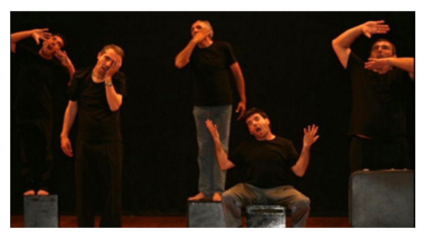
Figure 1. A scene from Tristeza de Mundo in 2008.

The following play, Naturaleza Humana ( Human Nature ; see Figure 2), was an exploration of the everyday effects of homelessness. For one of the actresses (M., women, 53 years old), this theatrical production was a faithful depiction of the constant anxiety and "anguish caused by living rough, day in, day out." It focused on the lives of the homeless characters and took place at a crossroads leading nowhere. On cold winter nights, when the rest of society was sleeping, they would meet up to share their secrets with one another. Throughout the play, the longing of the characters for things to be different and for there to be more opportunities was clear. Their shame