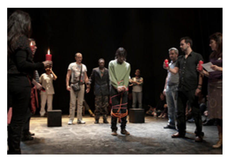
Figure 3. A scene from Se Comparte Mundo in 2012.