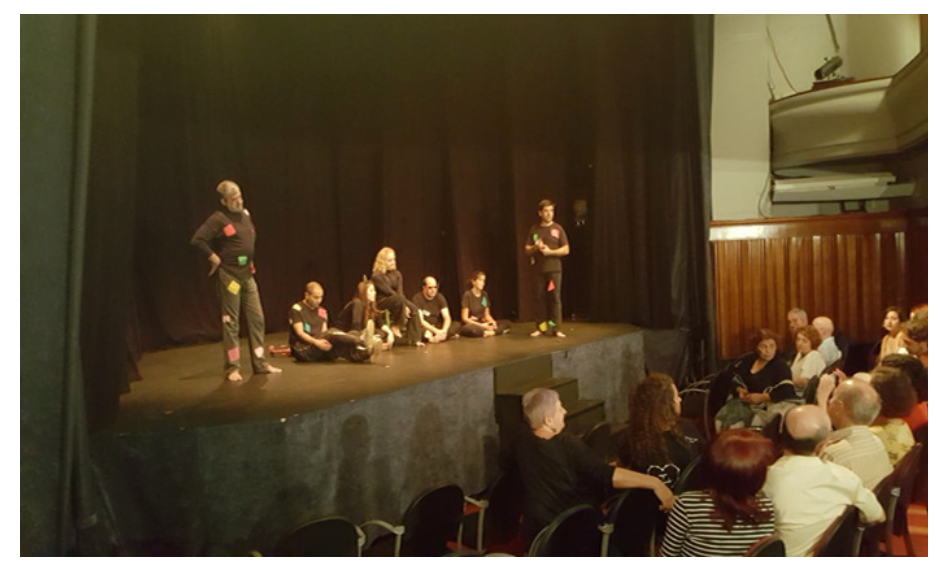
Figure 6. A debate between the actors and audience following a performance by Teatro de la Inclusión.

In February 2019, the University of Granada organised a seminar on Teatro de la Inclusión. The event ended with the final performance of the group and marked the end of the initiative, which had run for twelve years. The decision to end the project had been taken the previous year for two main reasons. Firstly, the socioeconomic crisis the majority of the participants were living through, meaning certain members were not able to attend the sessions as normal, something which led