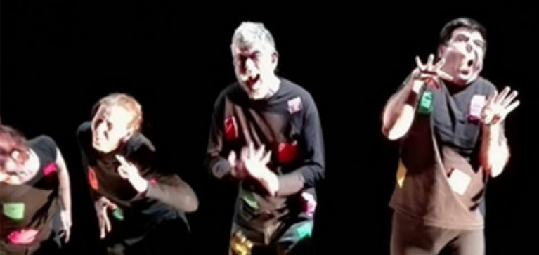
Figure 5. Two scenes from Breves Relatos de Vergüenza y Olvido.

relating to aesthetics, methodology, production, etc. By way of these spaces for dialogue and critical discussion, as well as the plays themselves, the audience was able to learn more about the reality of homeless individuals. For a short space of time, art enabled a dynamic based on participatory democracy using two techniques. On the one hand, through creativity, a group of individuals excluded from mainstream society was able to create something collectively, and thus find their voice and take action (Ricœur, 2005), and on the other hand, through dialogical consensus (Habermas, 2012), different groups within society were able to meet and hear each other's perspectives on homelessness. A particularly salient example of this journey of discovery occurred following a performance of Naturaleza Humana, when a member of the audience noted: "There are lots of people who should watch your play because they have no idea what people like you go through." A similar sentiment was expressed following another play, when a member of the audience remarked: "Nobody deserves to live in such inhumane conditions, without the chance to better their life, something which is so important." Furthermore, during a discussion at the end of a performance of Breves