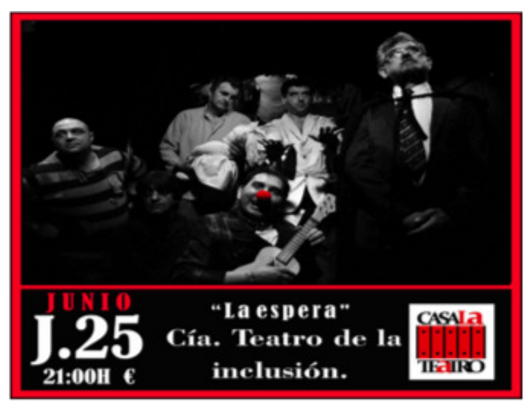
Figure 4. A poster announcing the premiere of La Espera at a theatre in Seville.

many individuals who are not represented by any parliament or government body."