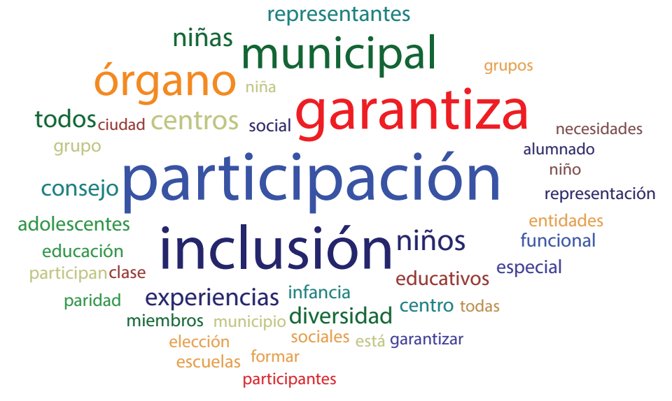
Figure 2. Word cloud.