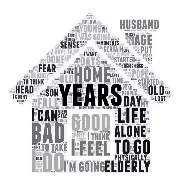
Figure 2. The House of Words: How the elderly and their reference people represent ageing. Note: The words in the house were identified through the NVivo software through a "word frequency" of the words in the analysis code of the "ageing" text corpus, which includes the interview excerpts concerning the elderly's personal self-perception and the reference persons' representation of ageing.

As shown in Figure 2, the most used term is "years," followed by "home," and "I feel alone." For almost everyone, the key element of feeling old is the years passing by and the astonishment at how quickly they have passed, with some differences between the elderly and the reference person. Home is par excellence the place where life goes on: It is both a protection and a cage from where it is increasingly difficult to escape and offset that widespread sense of loneliness among all interviewees, despite family or friends being available to provide