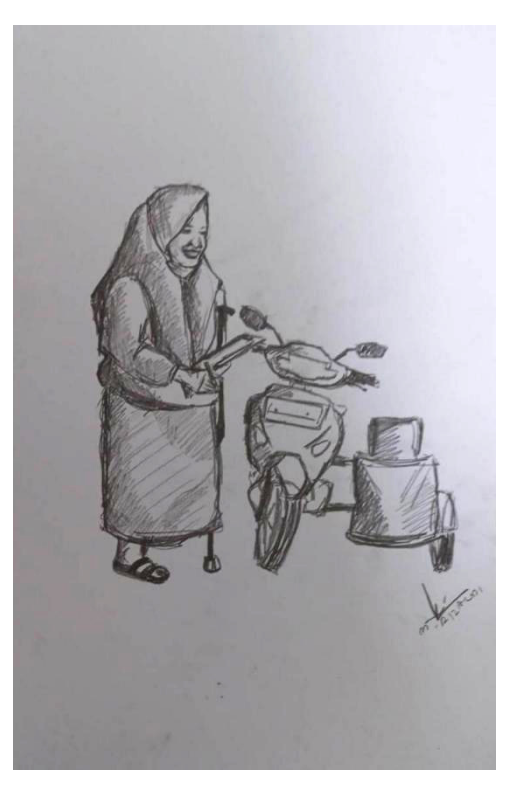
Figure 3. Rahimah and her a three-wheeled motorcycle, drawn by Rizaldi.

Rahimah and Fajar are also active in collecting data about diffabled people living in the city. There is no formal data available on the population with diffabilities, so they work voluntarily at the grassroots to identify people across the city, then leverage their networks in the private sector or government to try and source necessary support. During the worst floods, they help mobilise and distribute food donations. Rahimah rides a three-wheeled motorcycle (see Figure 3) that she and her husband personally modified so she can drive it with just