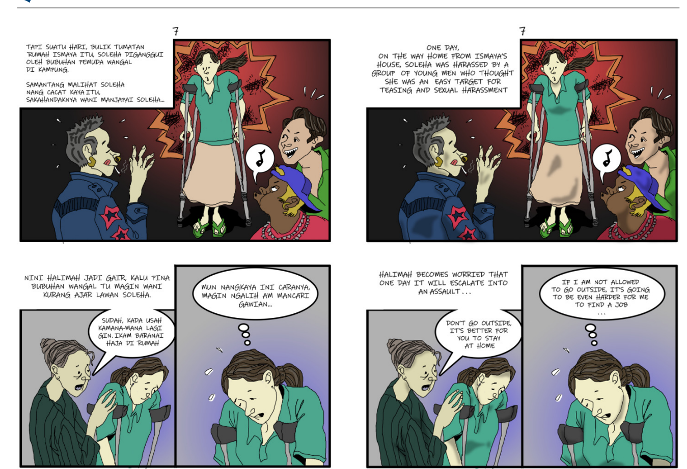
Figure 1. Excerpt from a Banjarese comic (with English translation) illustrated by Ariel and Zaldi about the experiences of women with diffabilities facing harassment on the street.

The intersecting forces of poverty, gender, age, and stigma not only shape the lives of people born with diffabilities, but also increase the risks of people acquiring diffabilities. Informal work and accompanying precarious incomes often restrict people's access to quality healthcare and routine medication, intersecting with ageing to exacerbate medical conditions, often leading to permanent diffabilities. During the writing of this article alone, we heard the distressing news that one of our participants had become blind due to ongoing complex health issues and persistent stress, while another had lost his legs due to a traffic accident. When we met Ahmad, a fisherman in his late 50s in Lombok. He had been recently paralysed from a diving accident. He used to work as a compressor diver: a fishing technique where he dived down to 30 meters using a dive regulator with a hose connected to an air compressor machine on a boat. Ahmad, along with many other compressor divers across Indonesia, did not wear proper scuba equipment and had limited access to diving health and safety standards, making them prone to decompression sickness. At the same time, as fishing communities in Lombok explained to us, economic pressures placed on men as the heads of their households translated into burdens to provide more money to the family, often forcing fishermen to push their bodies to the limit and jeopardise their own