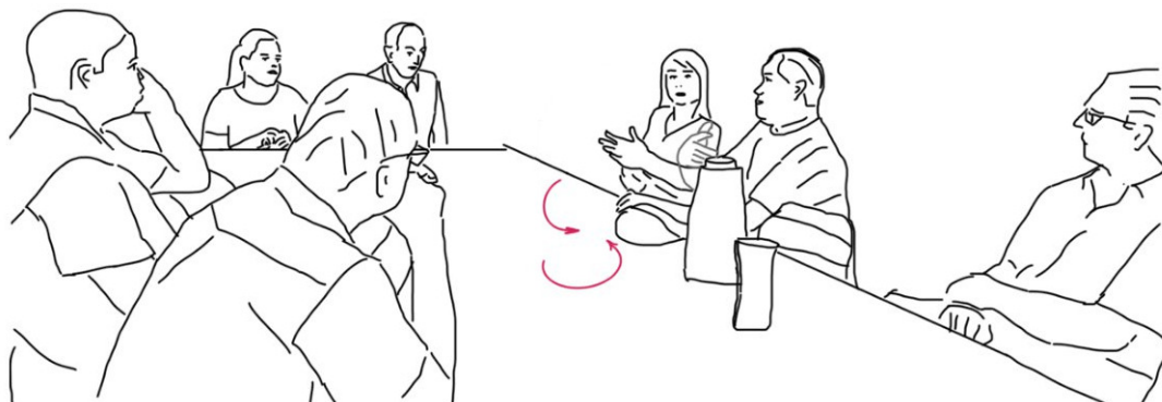
Figure 1. Pablo draws a circle in the air, pointing his hand toward the co-present participants.

12 PABLO: arif. ja- ja: säger också kultur (0.9) e: (1.3) arif. I- I: say also culture (0.9) u:h (1.3) 13 de er (0.4) e::: vi måste ha:: medveten, it is u:::h we must ha::ve awareness, 14 (0.5) 15 PABLO: medveten e:: (0.9) att- a: byta. att byta, awareness u:::h (0.9) to- u:h change. to change, 16 att byta::: (0.8) nya::: (. ) nya::: (0.7) to change::: (0.8) new::: (. ) new::: (0.7) 17 nya (odlar). new (cultivates). 18 ARIF: a. a. yeah. yeah. 19 PABLO: nya sak. new thing. 20 ARIF: a. a. yeah. yeah. 21 PABLO: a:: att att ha: e:n en bra liv. yea::h to to ha:ve a: a good life . 22 *#(0.6) en bra:::* (0.5) sa:- samhälleç (0.6) a goo:::d (0.5) so:- societyç pablo *draws a circle with right hand* #Fig.01 23 ARIF: mh. 24 (0.6)