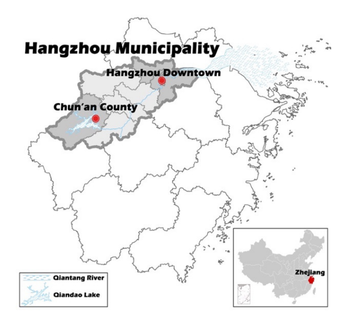
Figure 1. The locations of Chun'an county and Hangzhou in Zhejiang Province, China.

Chun'an is a peripheral county under Hangzhou's jurisdiction. It is Zhejiang province's largest county by size, covering 4,427 km<sup>2</sup>. Notably, Chun'an houses Qiandao Lake, spanning 573 km<sup>2</sup>, formed as an artificial reservoir after the completion of China's first indigenously designed hydroelectric station—Xin'an River Station—in 1959. Qiandao Lake became a tourism destination during the 1980s. In the 1990s, Chun'an embarked on a path of industrialization, capitalizing on its water resources to attract manufacturing industries like steel, chemicals, coking, and papermaking. This endeavor, however, contaminated Qiandao Lake and Qiantang River, which also traverses Hangzhou (Figure 1). Consequently, since the 2010s, Hangzhou has urged Chun'an to enhance environmental protection by carrying out the enforcement of an act of de-industrialization. This enforcement has pushed nearly all contaminative sectors and factories out of Chun'an (Chun'an County Government, 2022).