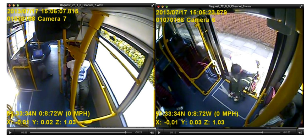
Figure 1. Showing a screen grab of each of the video playback angles used for task time analysis.

The detailed biomechanical study is fully described in Holloway et al. (2015). However, the methods are summarised here to aid the reader. Seven male participants with a history of a Spinal Cord Injury attended PAMELA facility. Each participant used a manual wheelchair as their primary form of mobility. Participants were asked to propel a manual wheelchair on a stretch of level paving, up a 6.5% incline and up a 12% incline, which was chosen to replicate the incline found on a London Bus access ramp. During the propulsion tasks, forces applied to the wheelchair push rim to estimate the provided capabilities of the user. In addition upper limb joint movement and shoulder joint muscle activity were recorded and used as inputs to a computer model of the upper limb, to estimate forces experienced at the shoulder joint. Shoulder joint forces have been shown to be correlated to shoulder pain and injury, therefore we think it is essential to understand the forces produced in undertaking the accessibility tasks both in terms of quantifying provided capabilities and also understanding the effect of coping strategies. It should be noted that all participants were free of shoulder pain at the time of this study and had not had a recent shoulder injury or pain.