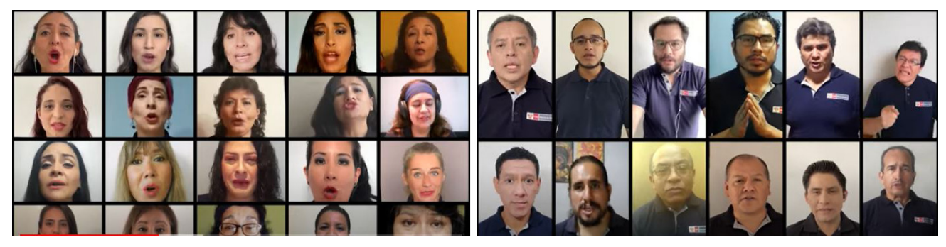
Figure 8. Screenshots of Contigo Perú being performed by the National Choir of Peru and the National Children's Choir.