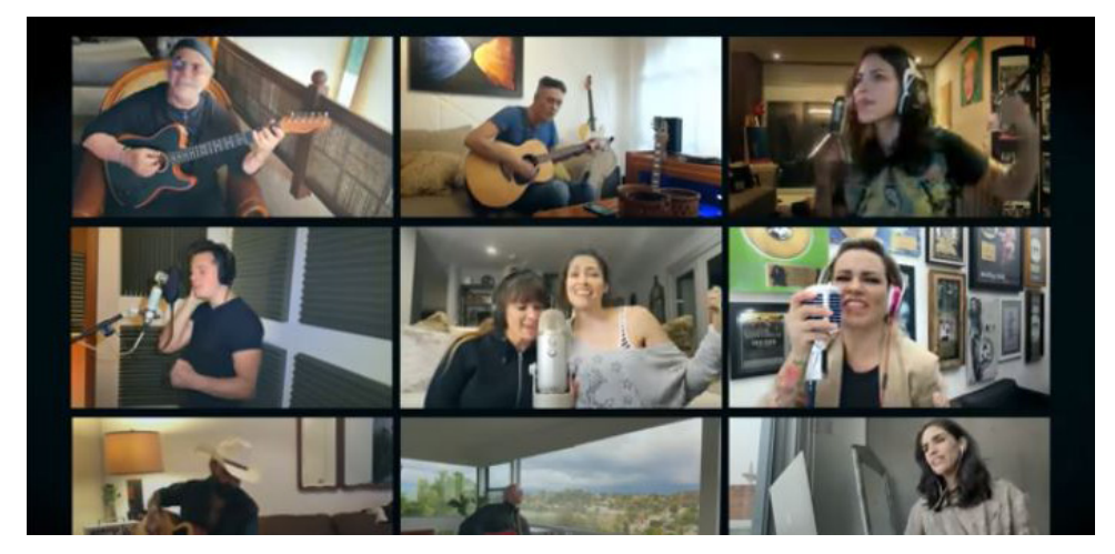
Figure 3. Screenshot from the official music video of Resistiré México.

social dialogue (Calderón-Garrido et al., 2018), even when considering negative emotions, promotes the idea that moods can still be improved in uncertain times.