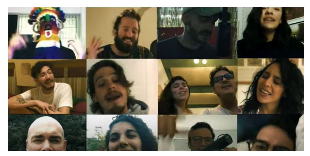
Figure 2. Screenshot from the official music video of Pa'lante , by Salomón Beda feat. 16 artistas Latinoamericanos.

Negative emotions were also combined with longing emotions, transforming feelings of missing loved ones, sadness, and suffering into a sort of motivation to keep waiting and hoping for a better tomorrow. "Learning from suffering" (Moss, 2019) takes place so that the individual (as well as others) understands and values social bonds, takes care of missing ones and, as a consequence, "does it right" when the moment comes. This