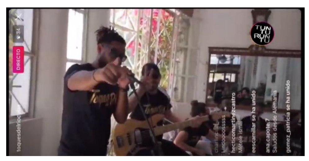
Figure 5. Screenshot from the project Tunturuntu Pa' tu Casa Sábado: 21 de Marzo de 2020.

bonds (Rimé, 2009) that go beyond geographical borders. Desires are particularly relevant for the study because music creation implies an intentional message in their lyrics. Therefore, when transmitted, desires connect with one's individual and social sphere through a reality that arguably became very similar around the globe. If the pandemic demonstrated anything at its inception stage, it is that humanity shares much more similarities, such as vulnerability and anxiety, than differences. An interesting example of new and global lifestyle practices—the result of adapting our means of communication—is present in C_007, an intervention of various artists, performing on what seems to be a WhatsApp group entitled #AngentinaCanta (see Figure 6).