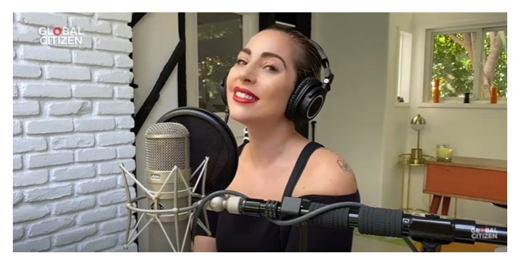
Figure 1. Lady Gaga performs Smile at "One World: Together At Home."

study (Alvarez-Cueva et al., 2020), longing emotions link with the desire and need to return to a pre-pandemic lifestyle. Through these emotions, it is possible to see how Covid-19 shifted known life worldwide, resulting in the emergence of romanticized references to what people used to do before the pandemic—a state that is both valuable and achievable with patience and faith.