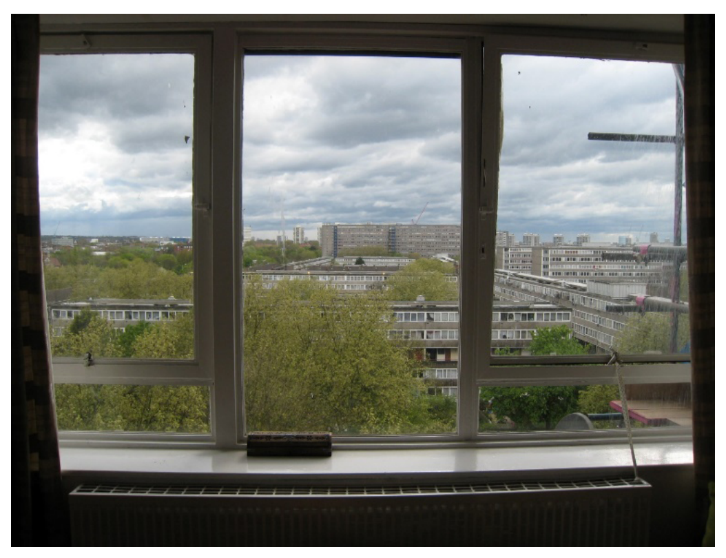
Figure 2. Aylesbury estate: Tenant's treasured view, 2012.