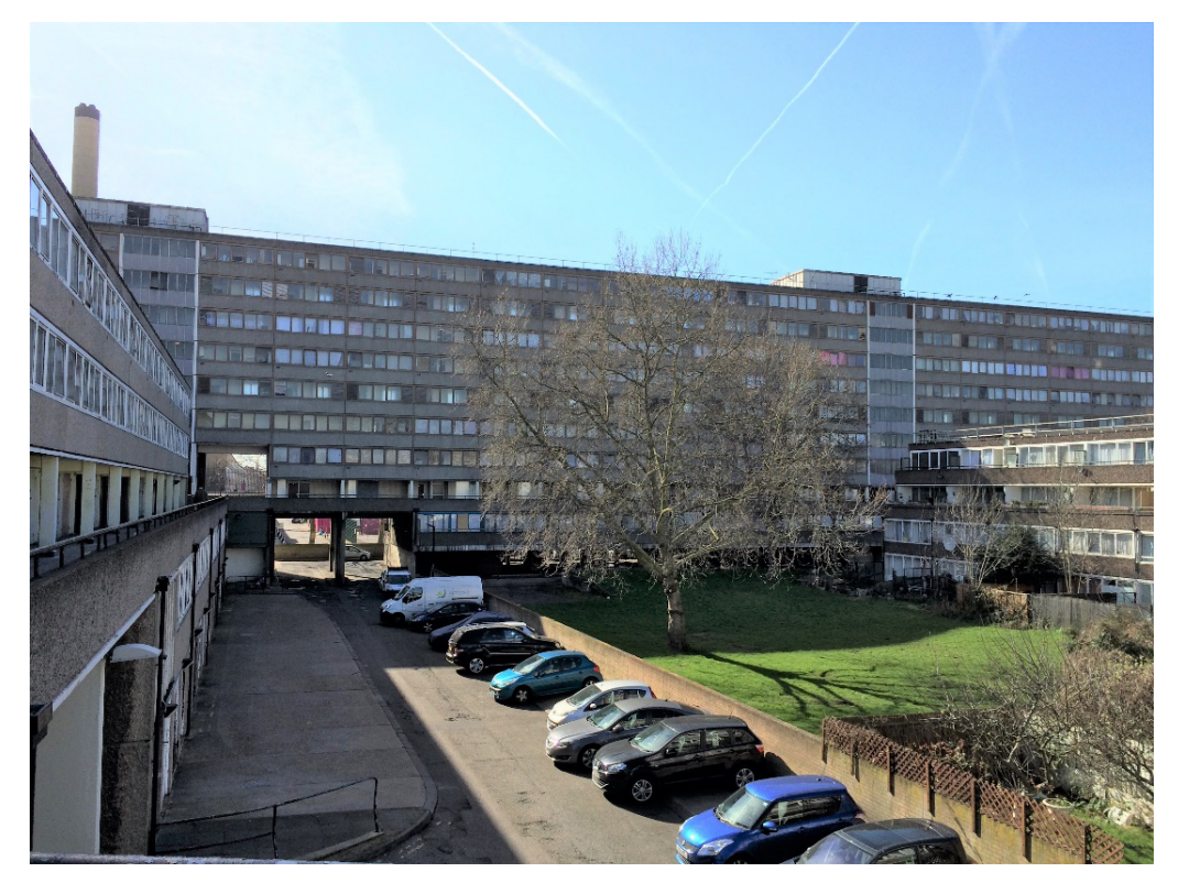
Figure 1. Aylesbury estate, 2017.

The research findings are drawn from several primary and secondary data sources. Fieldwork/participant observation was undertaken by the author via attendance at the following Southwark events which included Aylesbury residents' participation (2009–2018): eighteen housing, regeneration, and community meetings; Compulsory Purchase Order (CPO) inquiries (three days in 2015 and one in 2018); and several demonstrations. In-depth interviews were conducted during 2014–2017 with five long-term residents—two secure council ten-