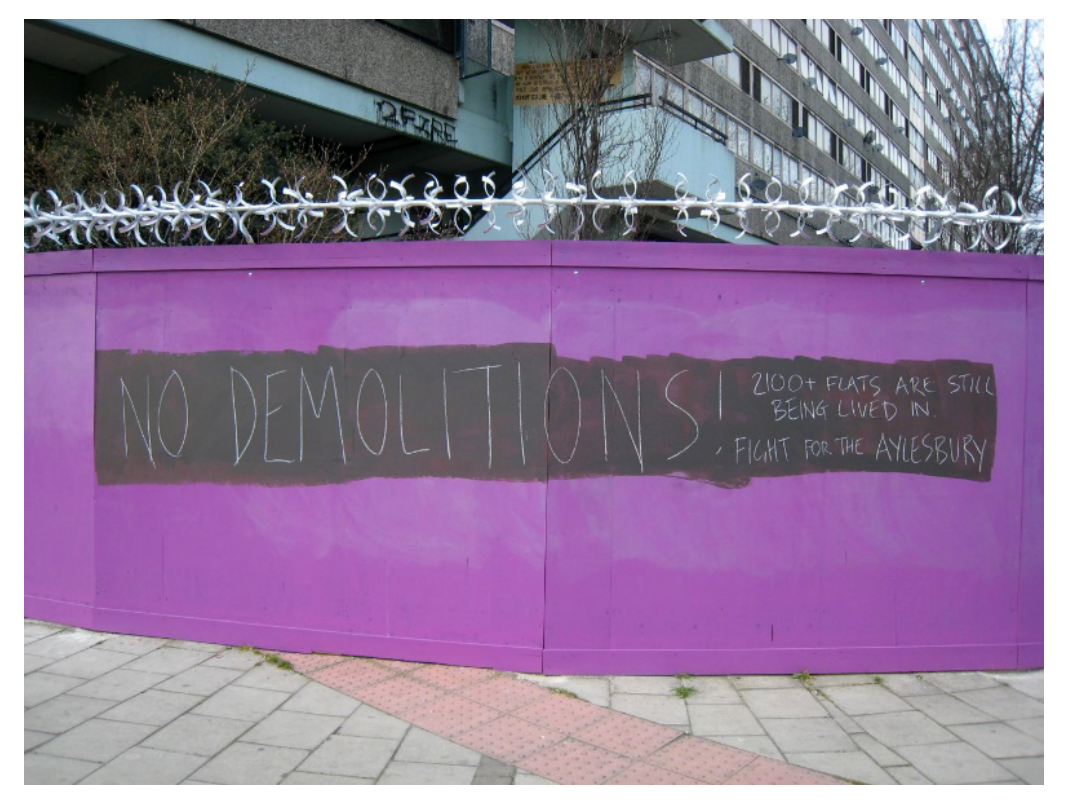
Figure 3. Aylesbury estate: Fortress and 'no demolitions!' 2015.

In the light of such persistent housing problems, it is hardly surprising that Aylesbury residents cynically felt the council was neglecting the estate due to its imminent demolition. Similar views had also been expressed at the nearby Heygate—"As an estate that has been earmarked for possible demolition and rehousing, many residents feel that equipment has been patched up rather than replaced, causing problems that repeatedly flare up in the cold weather" (Eighteen, 2002). A flourishing 'managed decline' narrative was prominent at the Aylesbury—