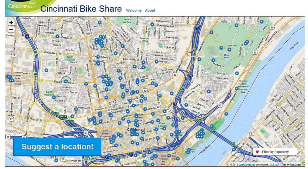
Figure 1. The City of Cincinnati's interactive GIS website interface.

The data collected through the crowdsourcing website was used primarily to identify desired locations for bike-share stations. Among the five main objectives of this plan, the crowdsourcing website informs two of them: (a) Evaluate the preparedness of Cincinnati and identify the most suitable areas for bike sharing and any obstacles that could impact success and (b) Identify an initial service area and size for a potential bike-share system from which to forecast expected demand, costs and revenues (Alta Planning + Design, 2012, p. 1). The project did not include other public participatory processes, relying completely on the online crowdsourcing tool. The crowdsourcing website was their main medium for collecting ideas and interests regarding the location of bike-share stations (Interview with professional 1, July 2014). Eight expert-based meetings with business owners and similar stakeholders were arranged. These meetings focused on exploring desired locations for bikeshare stations, based on space need and availability, travel flow, businesses' needs, and community demands (Interview with professional 1, July 2014). These meetings did not involve the public, but instead focused on "expert" opinions about bike-share planning (Interview with professional 2, July 2014). Since the mayor funded the project, the City Council was not responsible to approve the project.