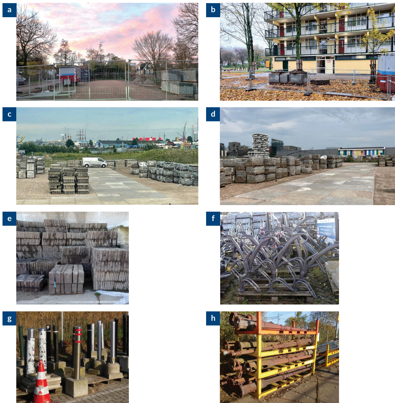
Figure 3. The three cases of urban space use: (a) PSS: concrete tiles 850 m from project site; (b) PSS: concrete tiles near flat building; (c) NSS: concrete tiles and curbs, and baked pavers (front view); (d) NSS: concrete tiles and curbs, and baked pavers (back view); (e) CSS: concrete tiles; (f) CSS: bicycle racks; (g) CSS: bollards; (h) CSS: lampposts.

plot of land that was prepared for real estate development. However, due to a delay in the real estate development, the plot is being used for storage until construction begins in 2 to 4 years. Predominantly pavers and concrete tiles are stored in this location. A contractor made the plot operational for storage capacity by creating a sand bed of \pm 90 cm, followed by a layer of gravel of \pm 30 – 40 cm. Also, three rows of concrete slabs were installed to create a road to provide sufficient space for transport vehicles. Finally, the site is surrounded by construction fences with a gate equipped with a lock code. In 2024, a project leader part of the area development in Buiksloterham (Amsterdam-North) managed the storage space. Materials for