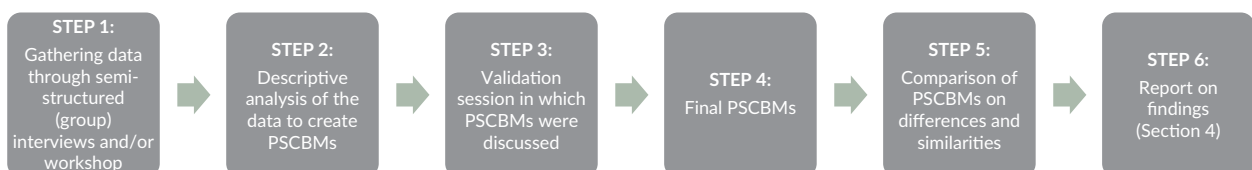
Figure 2. Research design.

We used a case study approach to gain insight into how (semi-)temporal space use can accelerate the circulation of materials in the urban space. A case study approach is well-suited when little perspective and empirical support on the phenomenon is available (Eisenhardt, 1989). Specifically, when no prior theory is available, case study research is a useful approach to gain insight and offer new perspectives (Eisenhardt, 1989). We analyzed three cases within the Municipality of Amsterdam, using a public sector circular business model (PSCBM) framework (see Section 3.2). We followed the sequence of steps displayed in Figure 2.