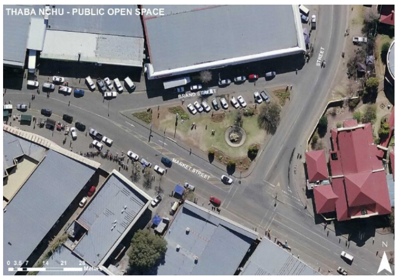
Figure 5. Driehoek Neighbourhood Park.

The open design of DNP supports the ebbs and flows of human and vehicular traffic. As shown in Figure 6, inhabitants transform the conceived DNP into a lived space, by overlaying its "physical space" and "making symbolic use of its objects" (Lefebvre, 1991, p. 39).