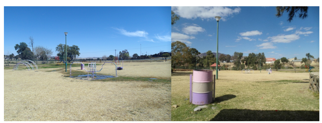
Figure 9. Marshy conditions beneath play infrastructure (left) and an underutilised waste-disposal bin and light post (right).

I don't' like the vandalism going on in this park. (User 3, personal communication, August 3, 2017)