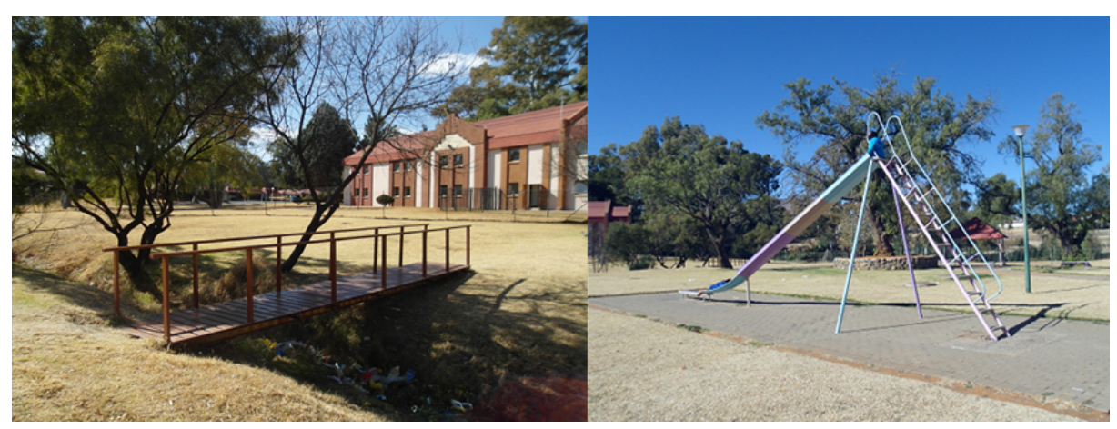
Figure 8. Waste in the gully (left); unsupervised children playing barefoot (right).