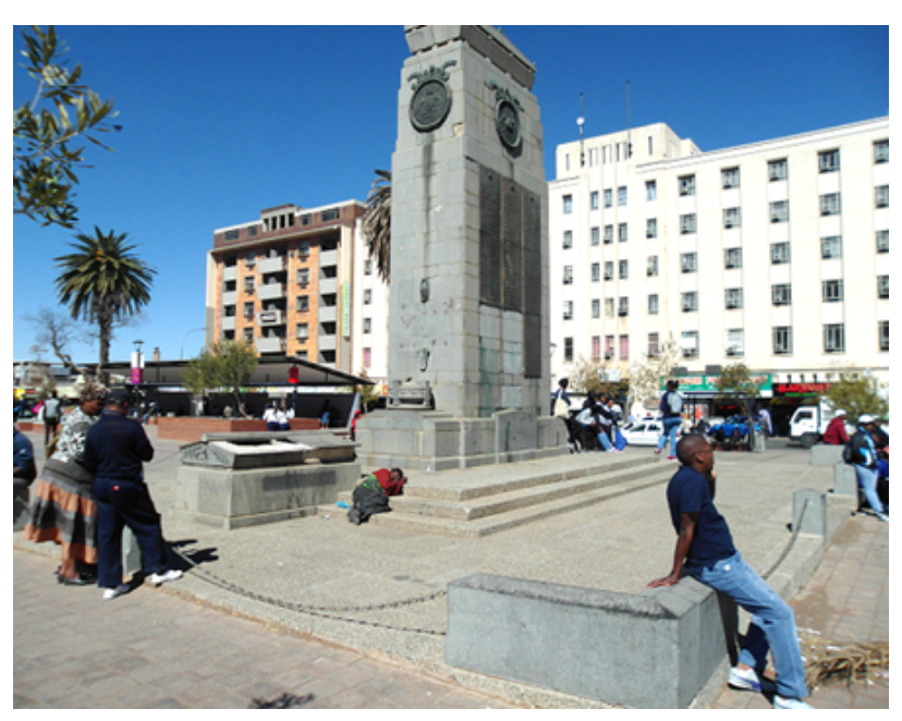
Figure 3. Appropriating Hoffman Square.

net. It creates an incessant spectacle between itself and users who take pictures in front of it night and day. The secretion of a clandestine tourist effect by the war monument that is managed by Free State Heritage, evokes heterotopia. According to Foucault (1984/1967, pp. 3–4), heterotopia is "something like counter-sites...effectively enacted utopia in which the real sites...found within the culture, are simultaneously represented, contested, and inverted". Lefebvre (1991) considers heterotopias to be mutually repellent spaces whose utopias (urban ideals) are occupied by the symbolic (lived) and the imaginary (conceived). Therefore, Hoffman Square's mutually repellent political heritage sites—along with the Africans that were once excluded in Bloemfontein—represent