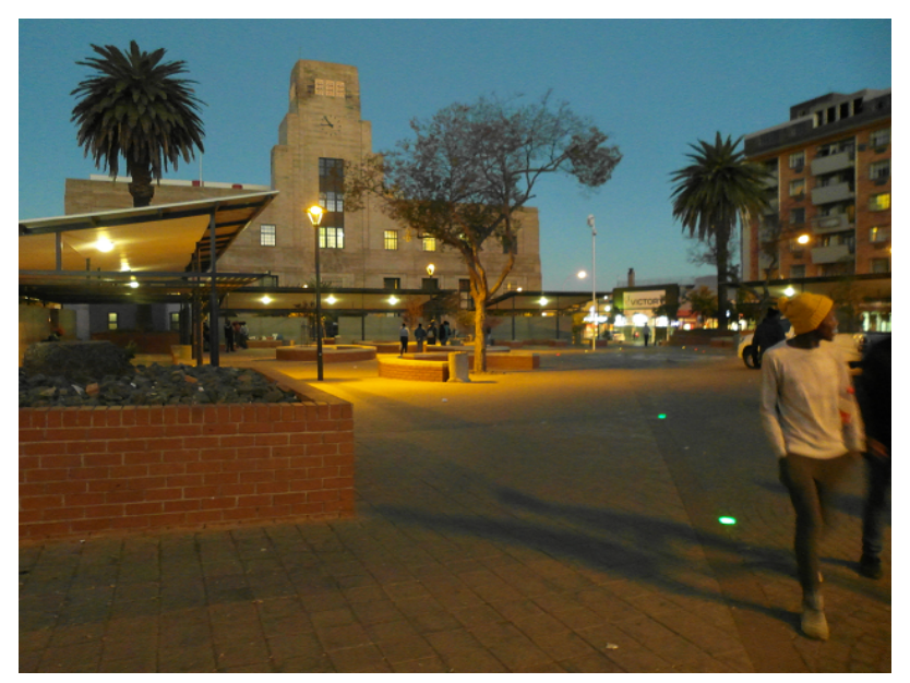
Figure 4. Night-time uses of Hoffman Square.

Though body (energy) reduction in the Square is also influenced by the declined state of the CBD, LED lighting however makes up for this. The Square's lighting systems—together with surrounding traffic, and street