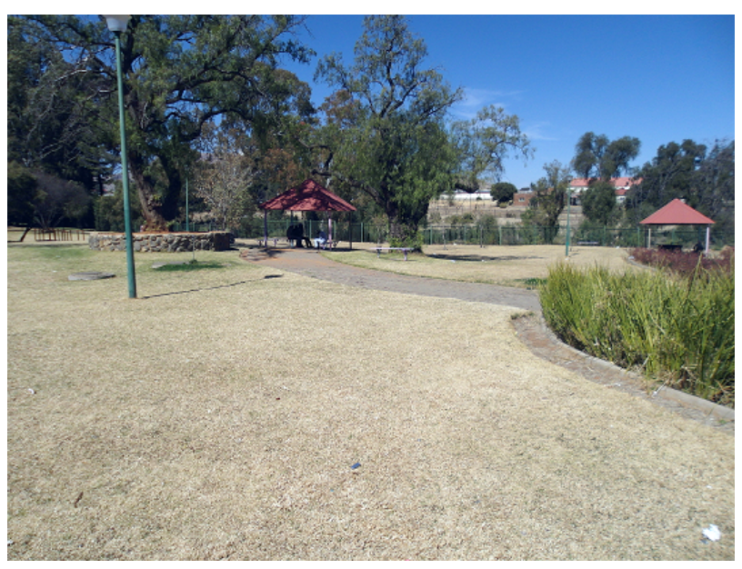
Figure 7. The laid-back rhythm of Old Regional Park.

Some public spaces in Mangaung have imposed time constraints and ORP is one such space (Mangaung Local Government, 2007). In the same way that users' space is lived, so is users' time. Lived time is "apprehended within space—in the very heart of space: the hour of the day" (Lefebvre, 1991, p. 95). The use of time by the conceiver to control spatial access and the lack of time for the lived to appropriate ORP fragments everyday life (Lefebvre, 2004). Fencing and human surveillance are symbolic forms of physical exclusion: they regulate a public space's time-uses (Varna & Tiesdell, 2010). Physical exclusion in ORP is not intentional since it is not in the interest of Mangaung to produce exclusive and exclusionary public spaces in Thaba Nchu. As regards its representations, ORP has lighting infrastructure that is dysfunctional, thus