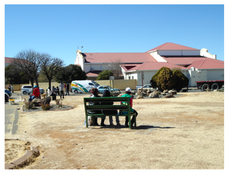
Figure 6. In diurnal spatial practice.

Despite its conceived uses, conflict emerged between lived space and the symbolic systems it overlays, as per Lefebvre's (1991) binary dialectic of the spatial triad. In 2015, DNP had a pond as its central feature. Inhabitants started using it to wash cars and for bathing—a social practice prohibited by the municipal by-laws of 2007. To enforce order, the city replaced the pond with a solid feature. In response, inhabitants formed an alliance with their spatial neighbours in the cultural centre (building in Figure 6), to provide them with water to allow them to continue washing cars at DNP. To date, there has been no policing of inhabitants' informal economic practice of washing cars. Despite its contradictions—which inhabi-