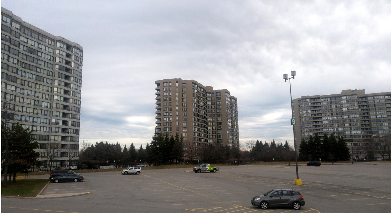
Figure 1. High-rise apartments in Toronto's suburban municipalities.