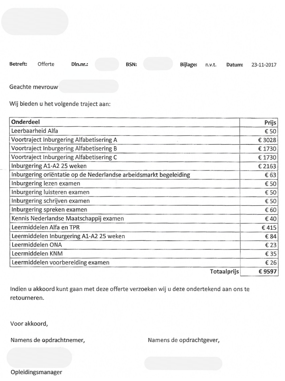
Figure 2. Copy of an original offer for a licensed language school, sent to an asylum seeker who lives in Kerkrade.

Ultimately, the total costs cover the attended hours only, though the loan interest is determined in advance. This business model applies a penalty that the asylum seeker must pay if s/he fails to finish the integration course within three years (Dutch Integration Law, 2006, chapter 6 §28). This illustrates how the 'pathways of sociocultural integration' as educational and financial practices are intertwined with a concentration of power by