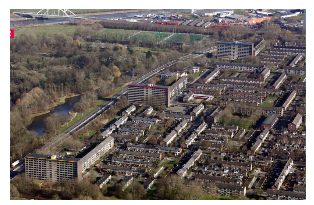
Figure 3. Selwerd seen from above, with three student flats located on the left.

In 2013, a neighbourhood renewal programme commenced in Selwerd and the student lock was abolished in 2015.