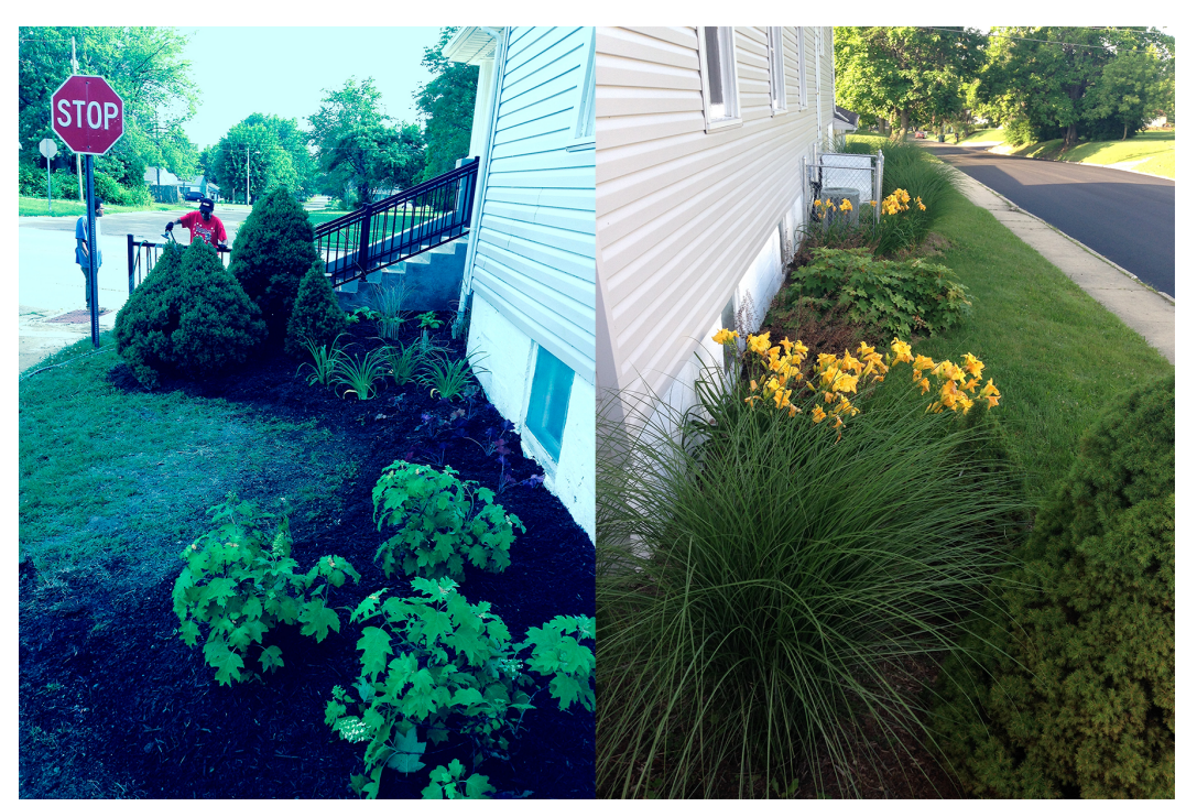
Figure 4. Schaffer Chapel northwest garden at the completion of the installation in June of 2014 (left), and in July of 2015 (right; images courtesy of the authors).

While still in its infancy, the Whitely Community Council began restoration on a historically significant civil rights church known as the Schaffer Chapel. While funding had been made available for the restoration of the church roof and siding, little money had been set aside for other aspects of the restoration such as parking or landscaping. To improve the church's image from the street on the northwest corner of the church, the council leadership worked with Ball State University and the Minnetrista Cultural Centre in 2014 to establish a planting plan and the obtain flowers needed for the garden at little cost to the community. A community work day was held and in the space of one day, the garden was installed (see Figure 4).