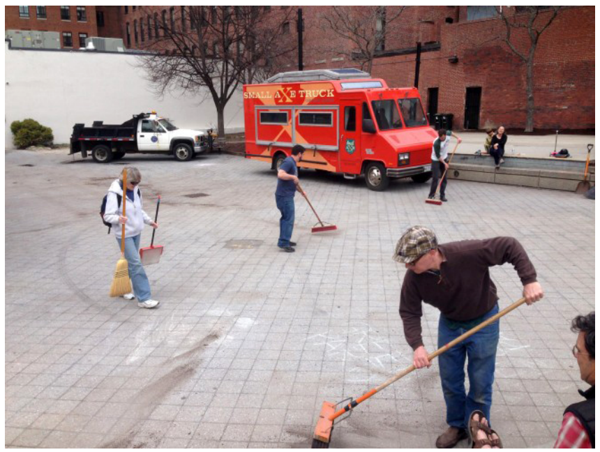
Figure 2. Friends of Congress Park during the park clean-up and revitalization of the park (image courtesy of Project for Public Spaces, retrieved from https://www.pps.org/article/the-story-of-congress-square-park-how-a-derelict-plaza-got-a-new-identity-downtown).