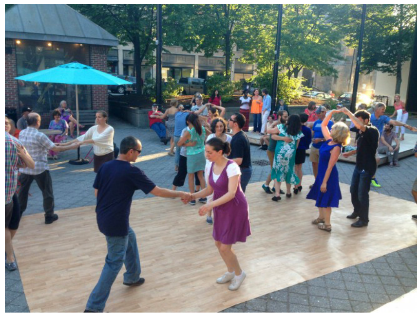
Figure 3. Swing dancing in Congress Park Square, Portland, Maine (image courtesy of Project for Public Spaces, retrieved from https://www.pps.org/article/the-story-of-congress-square-park-how-a-derelict-plaza-got-a-new-identity-downtown).

With community-based participation at its centre, an effective Placemaking process capitalizes on a local