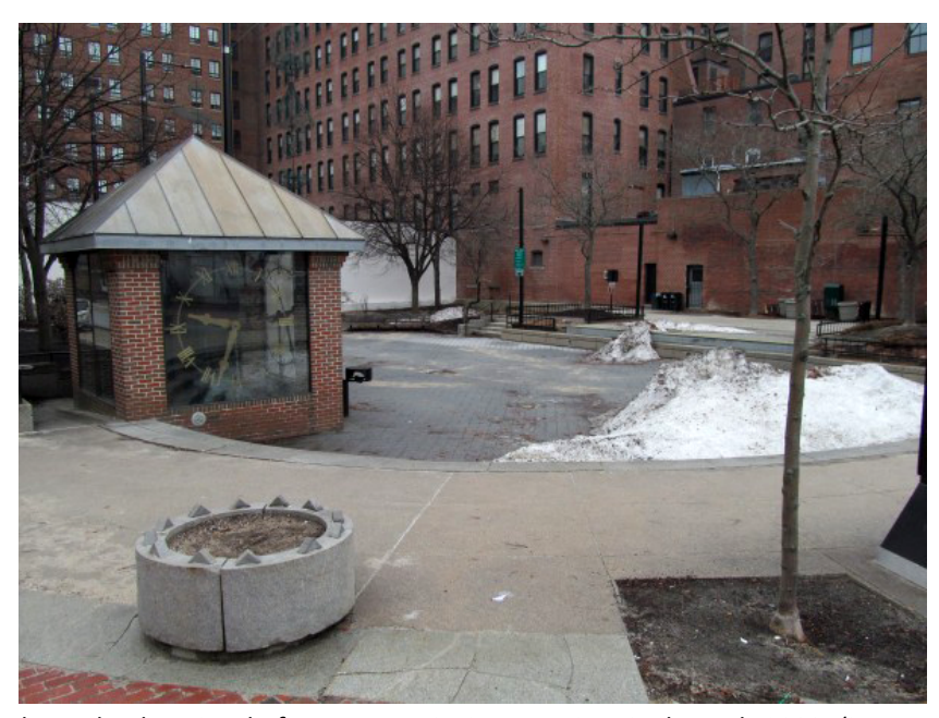
Figure 1. Congress Park, Portland, Maine, before community interventions in the early 2000s (image courtesy of Project for Public Spaces, retrieved from https://www.pps.org/article/the-story-of-congress-square-park-how-a-derelict-plaza-got-a-new-identity-downtown).

the Friends of Congress Square Park was formed bring the community together and revitalize the park. The group raised money, attention, and a great deal of interest in the park through the use of signs like "I want...in Congress Square" that were left around the city, and that the general public could write on all to share their aspirations for the park's future. The community group then started cleaning up the park and adding amenities (see Figure 2).