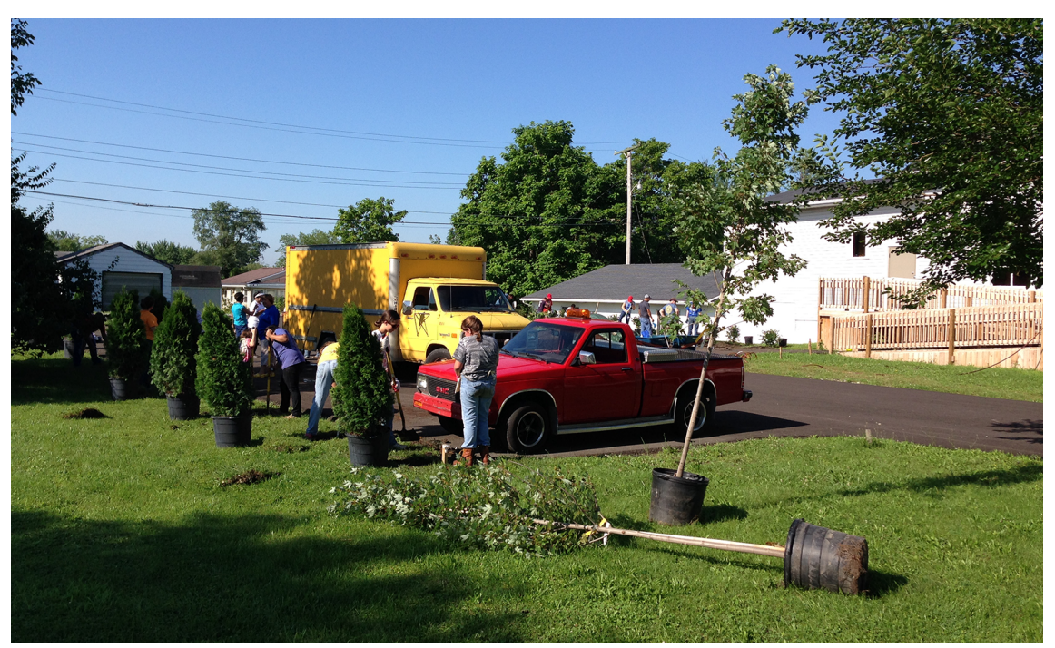
Figure 5. Installation of the vegetation, parking and church access ramp on the east side of the Schaffer Chapel in the Whitely Community in Muncie, Indiana (images courtesy of the authors).

Arnstein (1969) notes many different ways in which citizen participation can be incorporated into the planning and development process, and these levels of community participation and involvement can be viewed from low to high in a linear order. As placemaking requires community involvement and participation to occur at some level of decision-making, the lowest rung on Arnstein's ladder that could be considered a placemaking process is the level of partnership. At this level