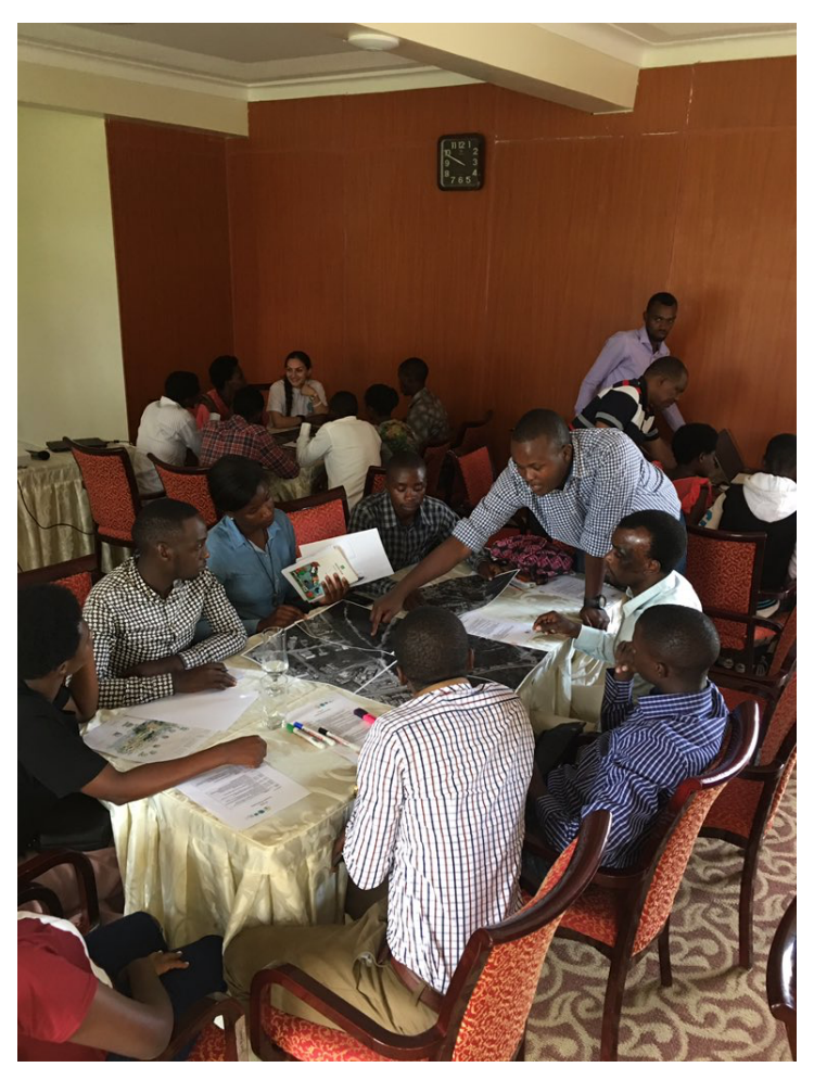
Figure 6. Public space participatory design workshop in Nyagatare, in November 2018.

In Nyagatare, although the DDS refers to resilience in terms of agricultural production, in an urban context, the master plan revision process defines resilience in terms of actions at the household level (such as rainwater harvesting systems), in construction and building (though the promotion of green building codes), water management systems and public spaces that can be used for improving climate resilience. For example, in Nyagatare, public space, coupled with agroforestry and water management, can support water retention for longer periods and its use for community gardens and public space maintenance, important in particular during the pro-