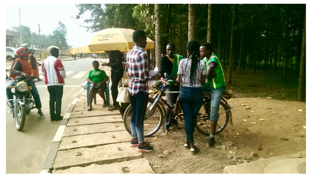
Figure 3. City-wide public space survey being conducted in Nyagatare, in August 2018.

In addition to the survey, a technical assessment of public spaces in Rwanda's six secondary cities was undertaken to gather information on what facilities and util-