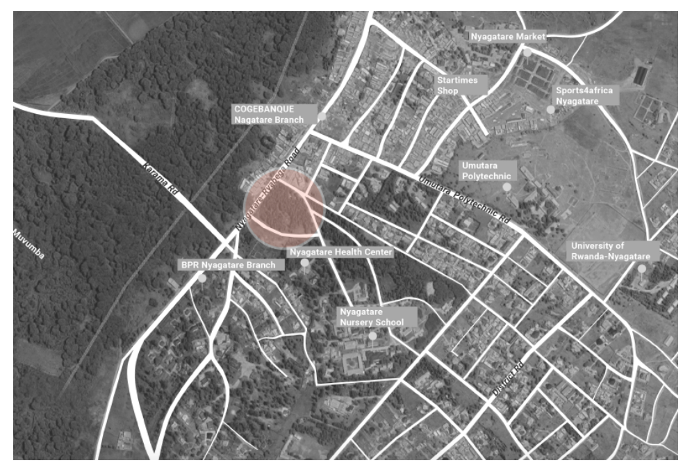
Figure 5. Location of public space within the city of Nyagatare.