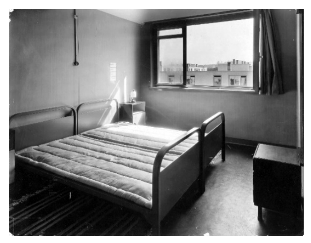
Figure 1. The 'Woba' Residential Colony Eglisee, 1930. Block 8, Artaria & Schmidt Architects. Bedroom, upper floor.

Although the street's name evokes images of exotic lands in distant countries, and could give grounds for speculations about exoticizing the flat-roof settlement, the street was formerly called Gotterbarmweg and only renamed in 1941 (Schnetzler, 2005).