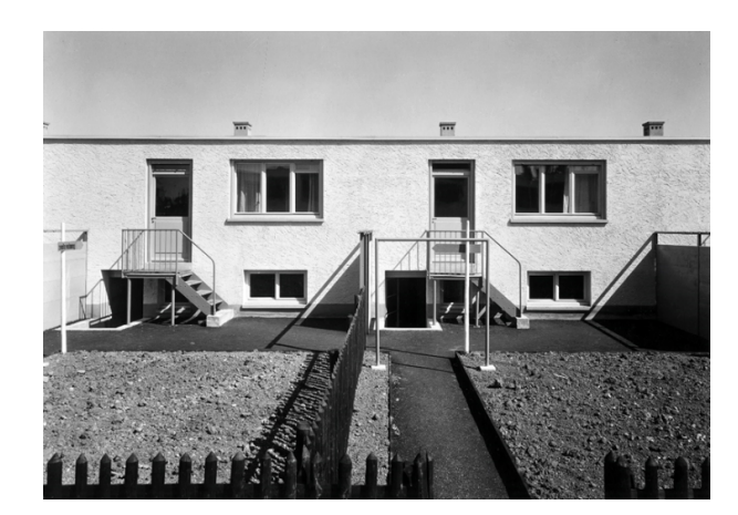
Figure 5. The 'WOBA' Residential Colony Eglisee, 1930. Block 10, Hans Bernoulli, August Künzel. From the garden.

simplification of the furniture. For [artists and architects], furniture is not a showpiece, but a commodity. The comfort and homeliness of a room does not depend solely on the furniture or even on a single beautiful piece, but on the practical design and arrangement of a room....Today we know the problem of the new home is not merely an artistic one, but just as much a technical, economic and socio-ethical one. (Kienzle, 1926, pp. 3–4, 7–8.)