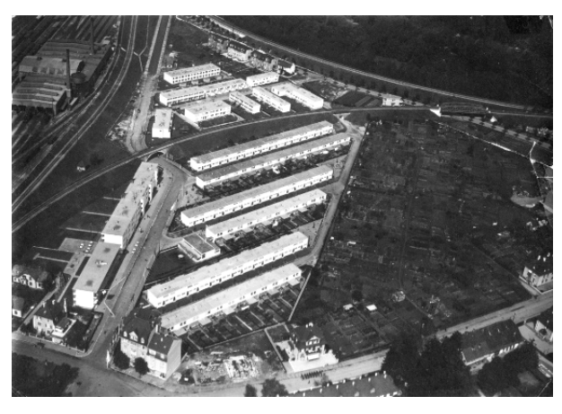
Figure 3. Siedlung Schorenmatten, 1929, and WOBA-Siedlung Eglisee, 1930 ("Siedlung Schorenmatten," 1930).

an important Basel-based architect and city planner. The realization of the Eglisee residential colony marked the endpoint of a larger urban development project of the Hirzbrunnen area on the outskirts of Basel (Mooser, 2000; Pola & Frischknecht, n.d.; Wohnbaugenossenschaften Nordwestschweiz, 2012). During the heyday of the cooperative housing movement in interwar Basel, around 250 houses were built in garden city fashion by Bernoulli and Künzel-all of them with steep roofs. It was only in 1928 when Hans Schmidt and Paul Artaria took over Hans Bernoulli's position as co-planners of the housing cooperative's Lange Erlen and Rüttibrunnen that the flat roof first appeared in Basel's residential areas (Figure 3; Artaria & Schmidt Architekten, 1928; Pläne der Wohngenossenschaften Lange Erlen, 1928).