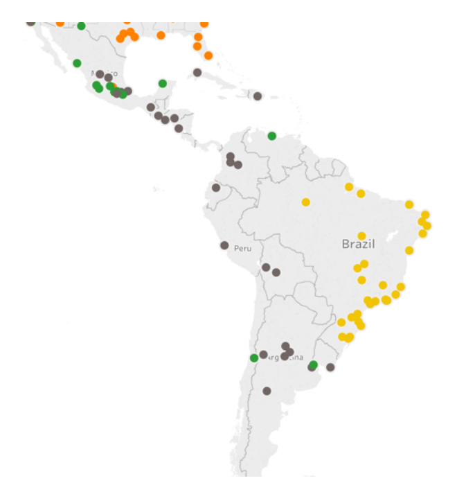
Figure 2. Members of the Latin American networks ANPUR (yellow), ALEUP (green) and CLACSO (grey). Source: Authors.

When looking at the distribution of planning networks it is therefore important to ask which institutions are identified in a particular regional context as planning schools, and consequently, which might see benefits in affiliating themselves with certain networks. In Latin America, the Brazilian network ANPUR has strong representation across the country, bringing together about 70 post-graduate programmes in disciplines such as geography and economics, urban and regional planning (Interview 4, 11 February 2019). Comparatively smaller seems the regional network ALEUP, which only represents 15 members in four countries. However, there is an alternative regional network, which is not part of GPEAN: the Network of Postgraduate Studies from the Latin American Council of Social Sciences (CLACSO). This network offers 101 Master and Doctoral degrees across 60 institutions in 17 Latin American countries (plus Spain and Portugal) in disciplines related to urbanism and territorial development (see Figure 2). It fulfils similar functions to the GPEAN members, such as organising regional conferences and providing space for knowledge exchange about urban planning pedagogies.