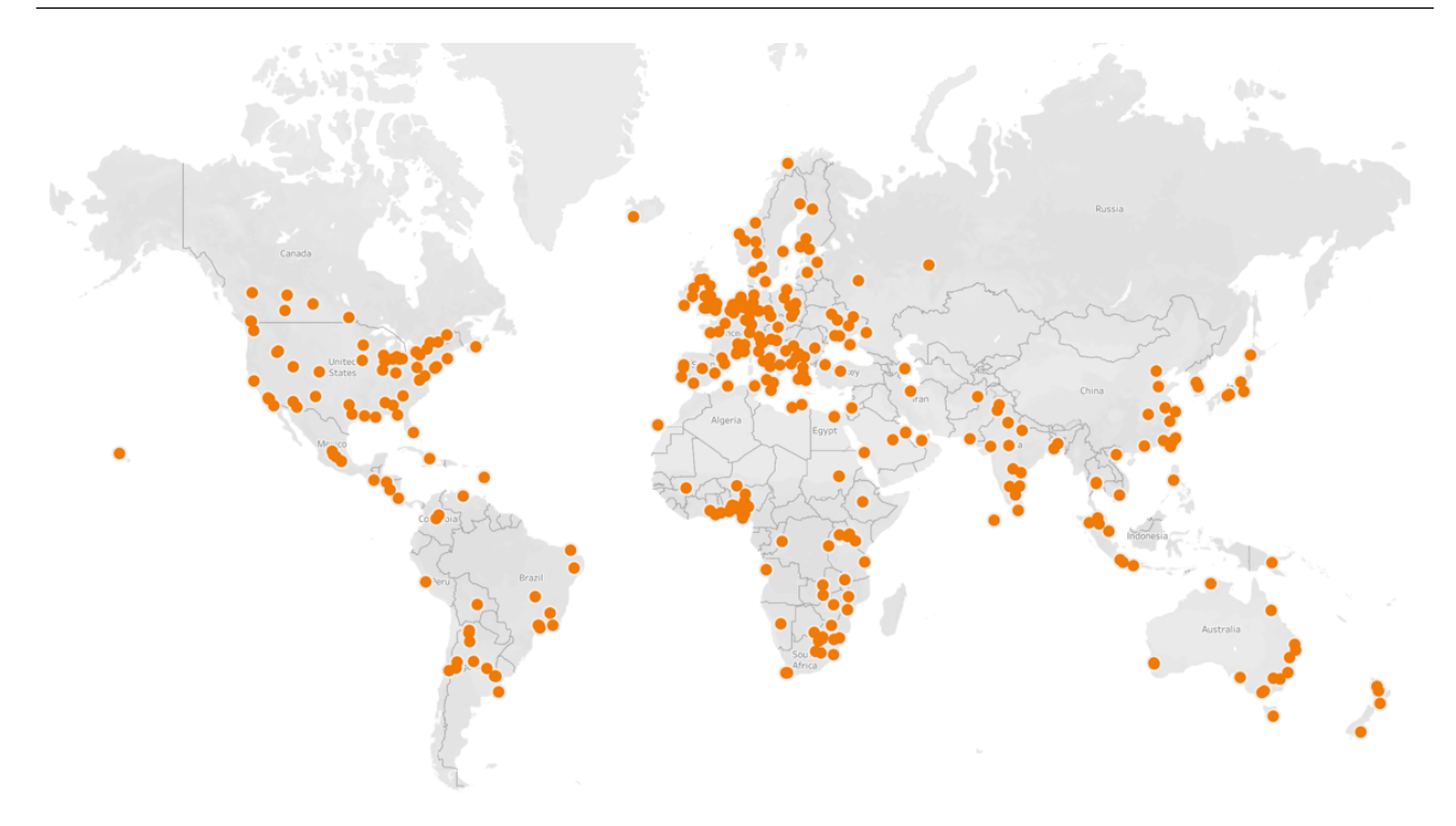
Figure 3. Distribution of 564 self-registered educational planning institutions.

and Women in Informal Development—Globalizing and Organizing through case and field-study based pedagogies (Odendaal & Watson, 2018). The specific rules and mechanisms of these engagements vary widely, with some collaborations facilitating frequent studio-based workshops over the period of a term while others conduct intense, week-long, sometimes international fieldwork and knowledge exchanges.