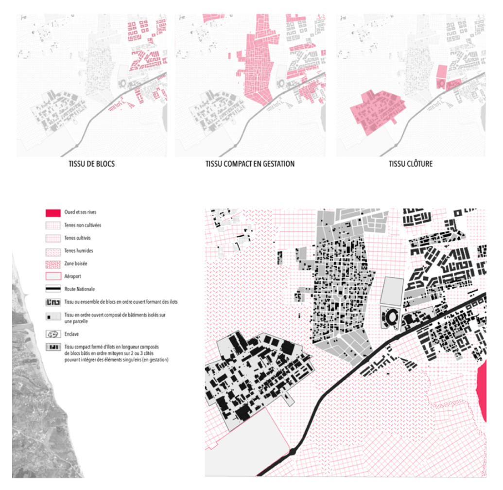
Figure 3. Grand Tetouan region: Synthetic map of the urban materials, close-up of the Oum-Kaltoum area with corresponding legend.

generated, i.e., Berardi, 1970; Caniggia, 1963; Caniggia & Malfroy, 1986; Muratori, 1959; Panerai, Depaule, & Demorgon, 1999), and to the notion of the territory as a palimpsest developed by André Corboz: "The territory is the object of a construction. It is a sort of artifact. It constitutes therefore also a product" (Corboz, 2001, pp. 213–214, translation by the authors).