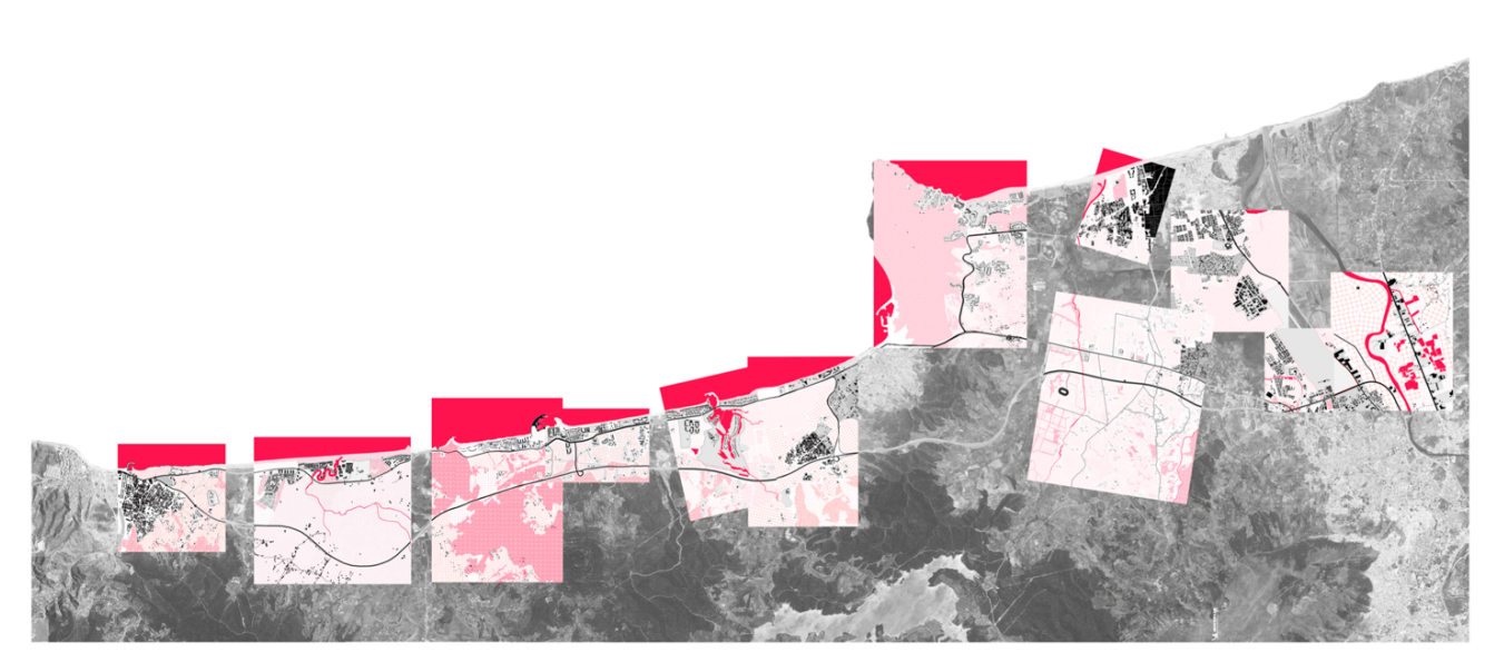
Figure 2. Grand Tetouan region: Synthetic map of the urban materials. Note: The graphic expression of the overall cartography was based on the one developed by Cesare Macchi Cassia's team in the study they realized on Milan in the late 1990s (Macchi Cassia, 1998).

The notion of urban material implies that each material has to be considered as an artifact, or a grammatical element of the 'text' given us to read. This relates to the Italian tradition of typo-morphological analysis and its structuralist background (see for instance the various letture di città —literally 'readings of cities'—it