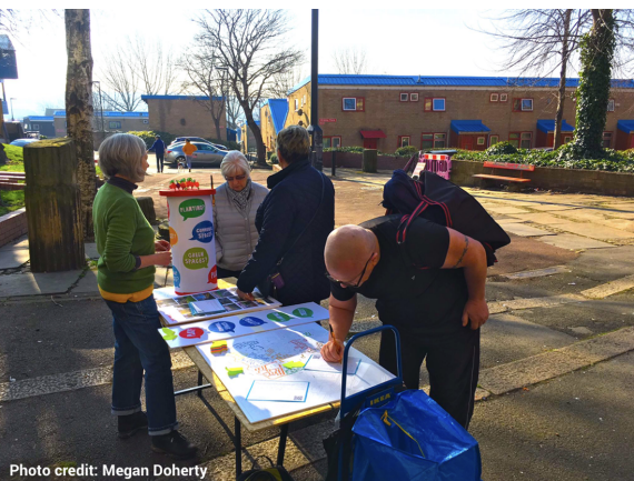
Figure 2. Presentation of the public facing map with various annotations from the public and consultant: the public visual artefact (left) and public event embedding the consultation in a local context (right).