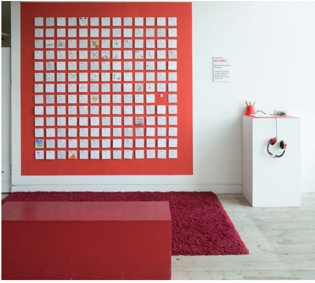
Figure 1. An example of one deployment at a modern art gallery in Gateshead, UK: JigsAudio device (left) and the public visual artefact—a tile mural of individual contributions (right).