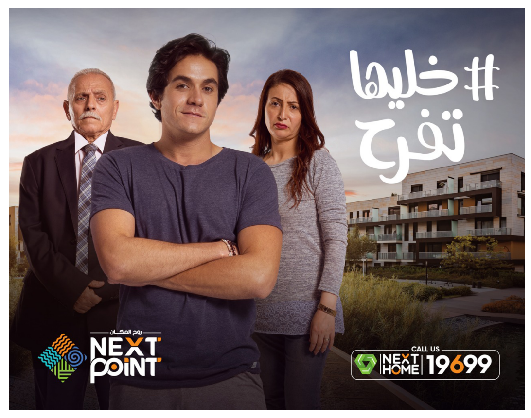
Figure 2. Photo from Cairo's real estate street billboards (translation: Make her happy).

caters beyond the reach of most Egyptians—condemned by those who cannot afford it? The pervasiveness of realestate advertisement could be interpreted from (1) the government's perspective and its desire to promote its political agenda manifested through its urban planning schemes, but also from (2) a bottom-up cultural perspective, which functions as an indicator of the general public's demands or least desires. The former reflection was shared amongst a number of scholars (Daher, 2013; Denis, 2006; Elmouelhi, 2019; Hassan, 2017; Shawkat & Hendawy, 2016), while the latter postulate remains under-explored. Accordingly, our research addresses the following question: