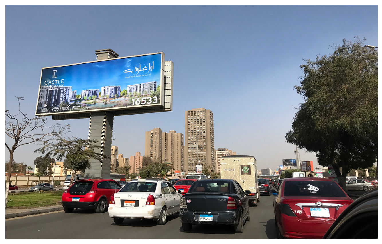
Figure 1. Two billboards on Salah Salem road in Cairo.

Accordingly, we want to shift the attention towards the public and its demand for housing. Our article demonstrates the urban everyday experiences of a population in a country in which a visual culture established via public media creates an urban imaginary that does not match the lived social, spatial, or economic reality of the majority of the population (Hendawy, in press-b; Hendawy & Saeed, 2019). Exploration of the general public's attitudes towards media narratives that focus their advertisement on high class residential projects launched this investigation. We base our arguments on empirical studies in the Greater Cairo Region (GCR). The Greater Cairo Region consists of Cairo Governorate, Giza Governorate, and parts of Qalyubia Governorate, with a total population of around 18 million as of 2006 (Bush & Ayeb, 2012). In this setting, a puzzle from our collected data guides our central research question: Why aren't ads for luxury housing—a market segment that