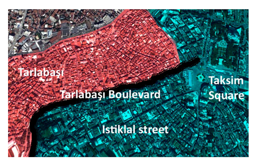
Figure 1. Tarlabaşı Boulevard separates the Tarlabaşı neighborhood from Taksim square and the Istiklal street area.

During the last decades, Tarlabaşı Boulevard has become a place for street sex work linked to precarious and vulnerable conditions as sex workers are exposed to greater violence from clients and police controls and the threat of sexual exploitation networks. Concomitantly, newcomer refugees from the war zones of the Middle East and North Africa arrived in Tarlabaşı in mid-2000 and especially during the current refugee crisis. The vast majority of Tarlabaşı residents are working in informal and precarious jobs as sex workers, waste collectorsrag pickers, peddlers, and street vendors, selling food in the nearby tourist areas for very low pay (Can, 2020; Türkün & Şen, 2009). Other employments linked to the region's residents include temporary labor in the textile