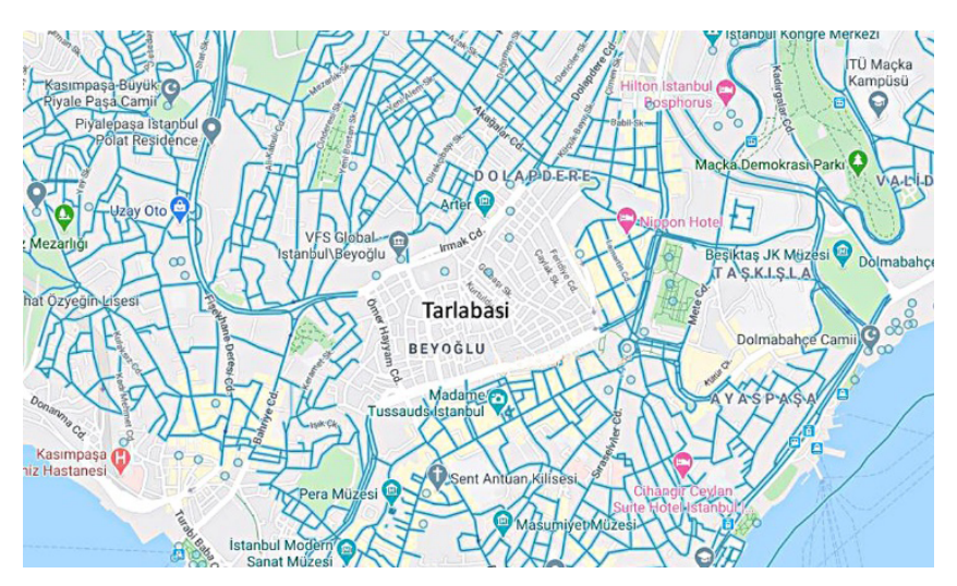
Figure 2. Google Maps' screenshot. The Tarlabaşı neighborhood is missing with no available street view.

Real estate capital enters Tarlabaşı with the massive demolition of building blocks and the rebuilding of modern housing for high economic strata residents. These instances of spatial injustice and prohibition of access to the center of the city echo Merrifield's (2011) description that the global metamorphosis of the cities' centers took place as "a vicious process of dispossession...spitting [the poor] out of the gentrifying center, forcing poor urban old-timers and vulnerable newcomers to embrace each other...out on assorted zones of social marginalization, out on the global banlieue" (Merrifield, 2011, p. 474). Indeed, the commodification and touristification of the area have already started. Airbnb apartments and boutique hotels have appeared in the perimeter of the neighborhood. Moreover, the prohibition to the right to the center and spatial injustice are produced along with gender, ethnicity, cultural norms, and class lines (Öz & Eder, 2018). Characteristic are the words of Aisha, a Nigerian transgender woman who has been living in Tarlabaşı for