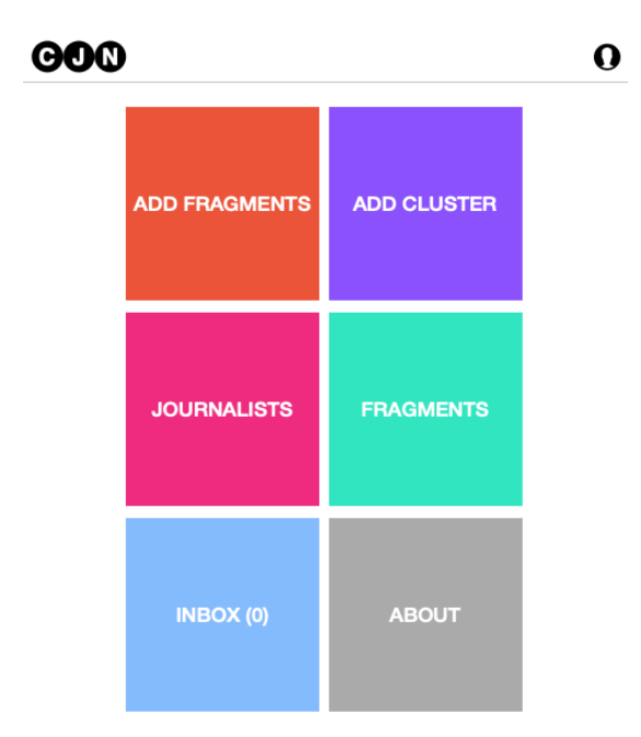
Figure 1. CJN home screen.

Users are able to assign story fragments to an identified, independent yet related story clusters that facilitate the aggregation of multiple fragments into thematic associations. Therefore, story fragments can be browsed as discrete objects by an interactive user as well as experienced from inside a collective format. Fragments and clusters may also be shared, assigned additional qualities and contributed towards by other users. The specific qualities of this collaborative ownership model of production are a deliberate incitement to disrupt the